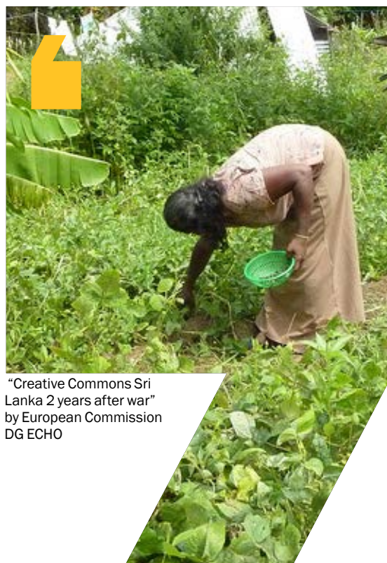
"Creative Commons Sri Lanka 2 years after war"

The Samurdhi programme, implemented since 1994, is the main safety net programme in Sri Lanka. The programme has undergone considerable change during the past few years and is now mainly structured as two components: the relief programme and the empowerment programme. The relief component encompasses the cash-transfer programme, social security fund and nutrition programme. The empowerment component consists of five initiatives: rural infrastructure, livelihood, social development, the Samurdhi housing programme and microfinance through Samurdhi Bank societies. The relief component provides consumption support and social insurance for households below a certain level of income. While the welfare grant provides immediate relief, the insurance scheme has a longer term objective of poverty alleviation as it aims at reducing the vulnerability of the poor in the face of life contingencies such as death, birth, marriage or sickness in the family. Beneficiaries are entitled to a lump sum upon the occurrence of one of the contingencies, varying according to the contingency. Some of these payments indirectly target women