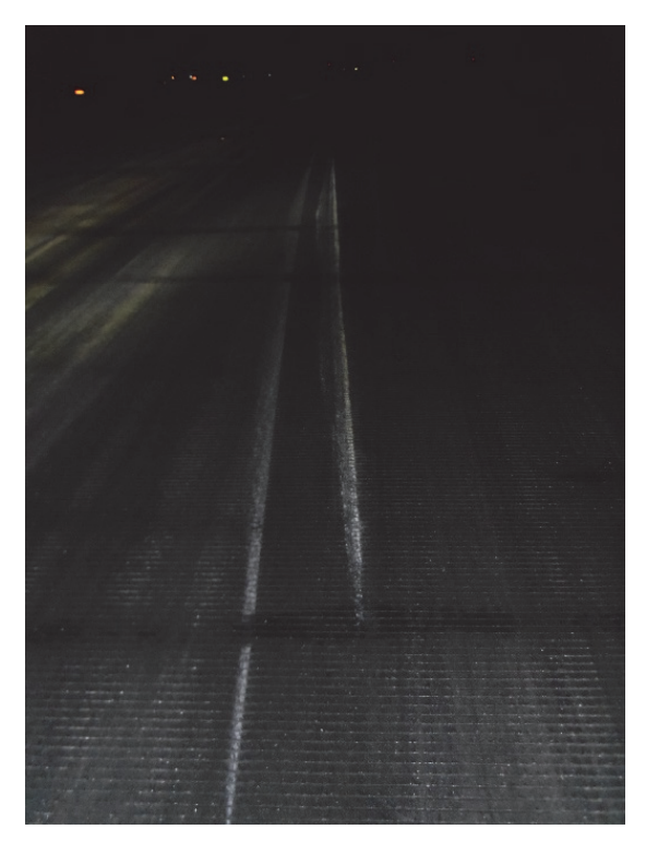
Figure 1 Witness marks on Runway 25, viewed looking east towards the landing threshold

An ATC controller thought he saw a spark from the vicinity of the aircraft when it landed and asked an airfield operations officer to investigate. A technician, working abeam the touchdown zone, told the operations officer that the aircraft had seemed to roll to one side while landing. The operations officer inspected the runway and found witness marks, which started approximately 270 m from the displaced threshold and 1 m to the left of the runway centreline (Figure 1). The operations officer passed this information to ATC and visited the parked aircraft, where the crew had discovered scuff marks and abrasions to paintwork on the left wingtip.