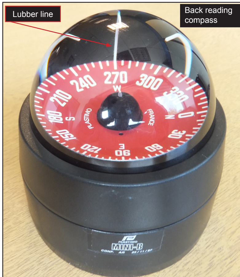
Figure 6: Plastimo Mini-B compass as seen by observer