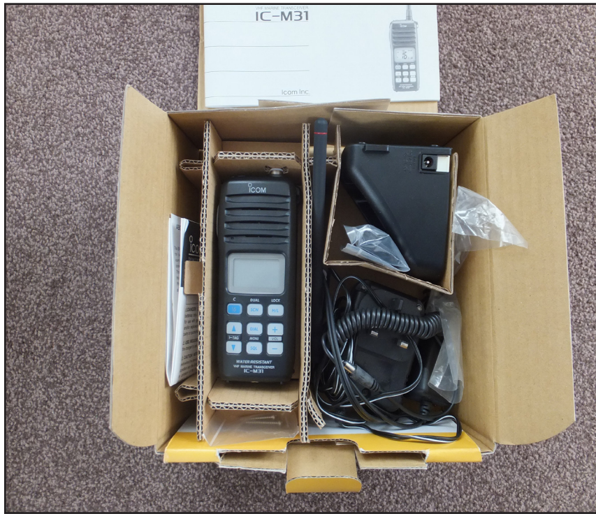
Figure 5: Marine VHF radio (unused)