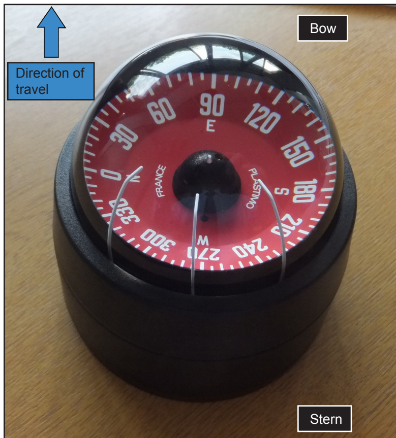
Figure 7: Assessment of skipper's view of compass when heading east with the lubber line aligned with west