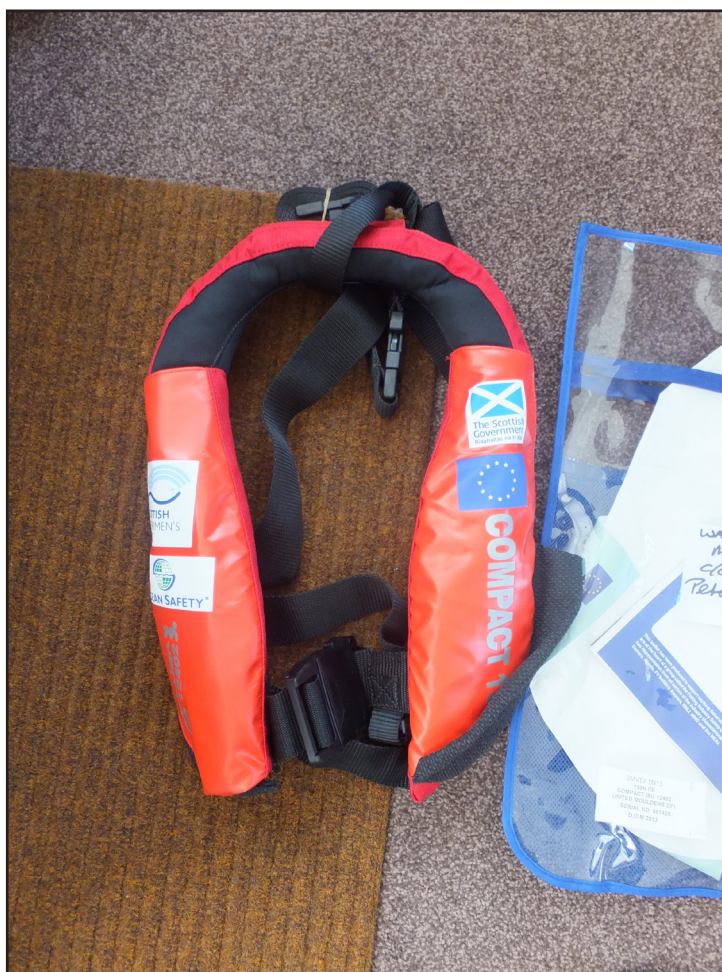
Figure 4: Ocean Safety personal flotation device (unused)

been issued to him by the Scottish Fishermen's Federation. However, the skipper and his grandson never wore PFDs when they went sea and only donned them at the instruction of the trawler crew once they had been rescued.