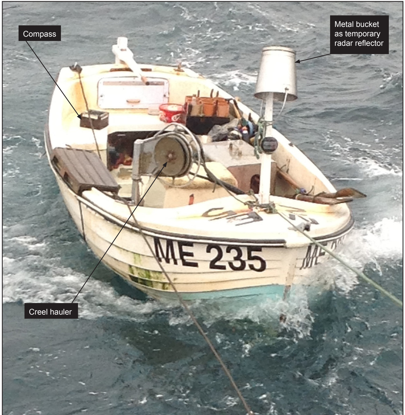
Figure 3: Water-rail under tow from Sylvia Bowers

issued with a safety certificate, confirming compliance with Merchant Shipping Notice (MSN) 1813 (F), The Code of Practice for the Safety of Small Fishing Vessels (Small Fishing Vessels Code of Practice), which was valid until 7 February 2015.