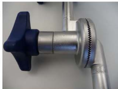
Figure 4: Open joint