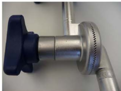
Figure 3: Insufficiently tightened star screw

An incorrectly tightened star screw can be recognised by the clearly visible and perceptible play in the toothed element (Figure 3). Since the teeth still mesh, the joint remains in position in this state.