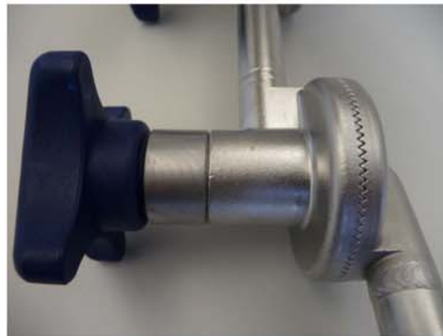
Figure 2: Surrounding toothed element and star screw

The joints have a surrounding toothed element in order to ensure form-fitted connection. They are fixed in place using star screws (Figure 2).