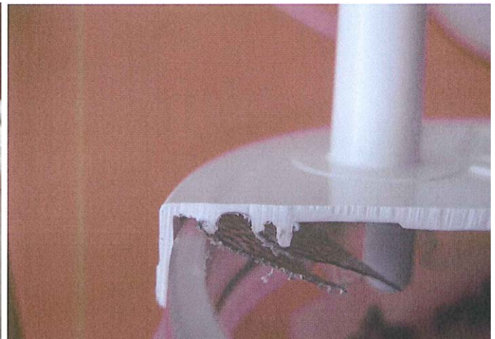
Image highlighting how the misaligned liner prevents a flush connection of the lid with the edge of the canister, which gives rise to inadequate vacuum.