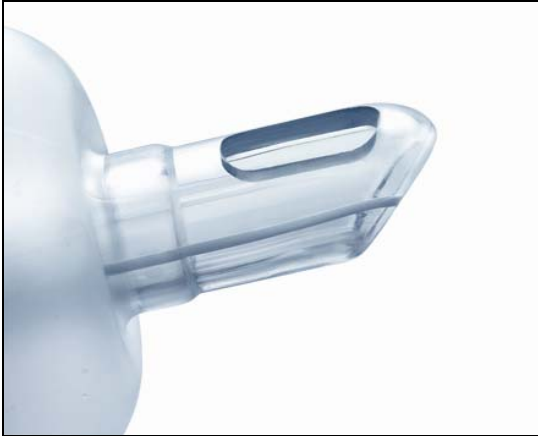
IMAGE 2 - Stylet