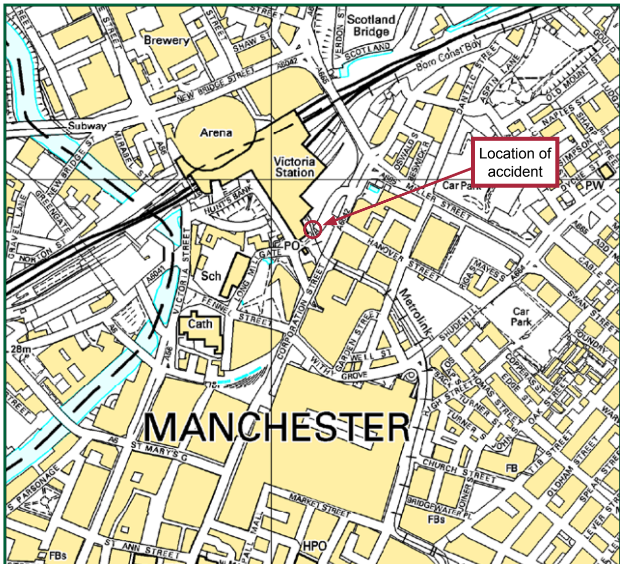
Figure 1: Extract from Ordnance Survey map showing location of accident.