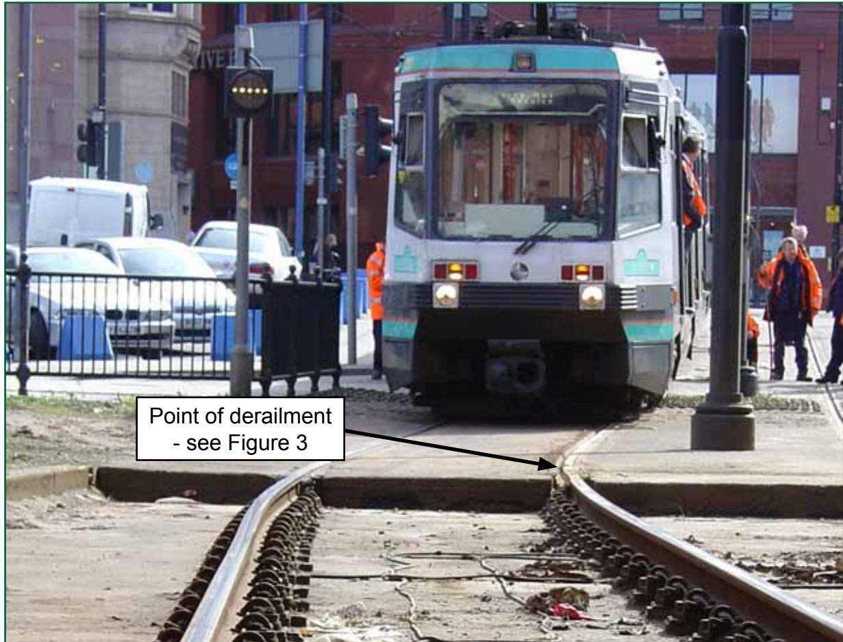
Figure 2: Derailed tram seen from the rear