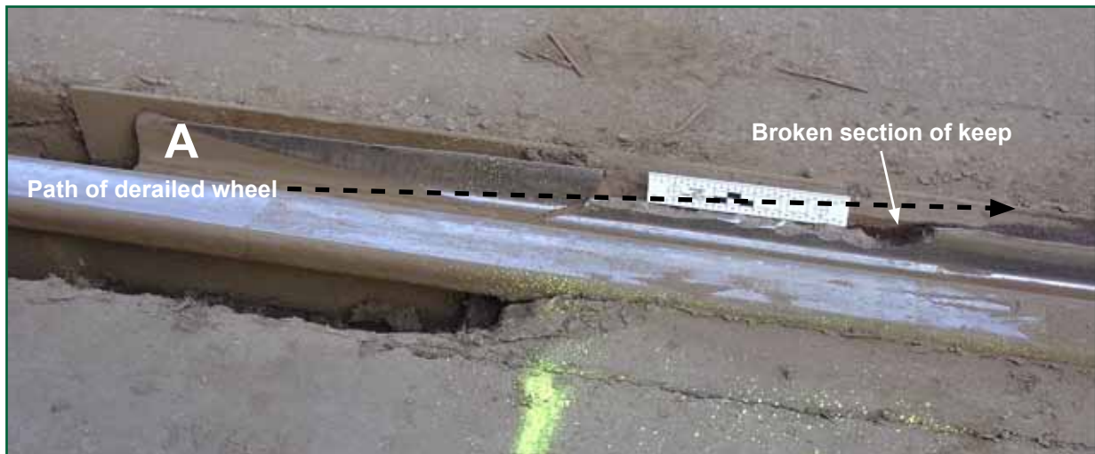
Figure 5: details of broken rail

29 It is significant that the transition between the two types of rail occurs on a curve. As a wheelset runs round a curve, it moves outwards a distance y , which is given by the expression: