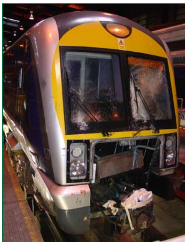
Figure 3: Damage to the front of unit 3014 (3 August 2007)