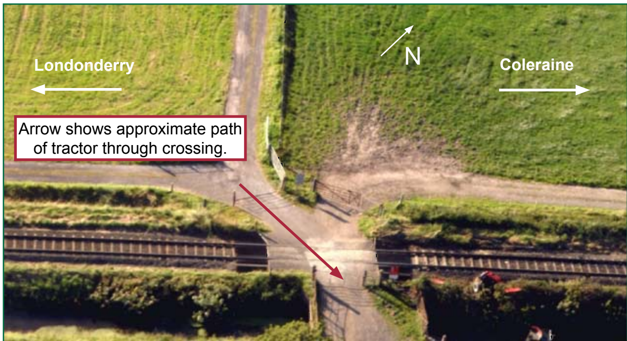
Figure 5: Aerial photograph of crossing XL202 showing 'dog-leg' (2 August 2007)