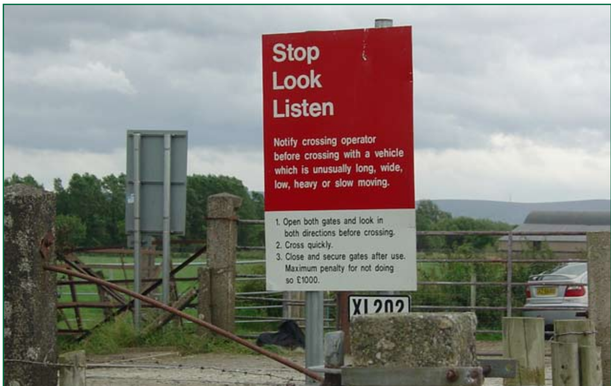
Figure 2: Signage at crossing XL202 (3 August 2007)