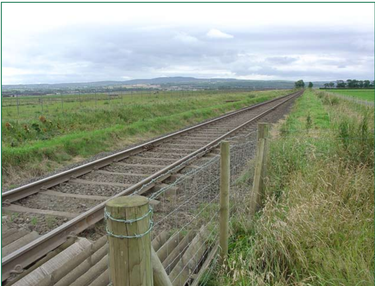
Figure 4: The view towards Londonderry from the north side of crossing XL202 (3 August 2007)

83 The signs at the crossing make reference to the need for users to look for approaching trains. For a tractor driver approaching the crossing from the north side, the view towards Londonderry is good, with no obstructions (Figure 4). The railway is straight at this point and affords a clear view over a significant distance (at least 1000 m) for a road user. The tree to the right of the line in Figure 4 is approximately 600 m from the crossing and train B413 passed the tree approximately 20 seconds before the collision occurred.