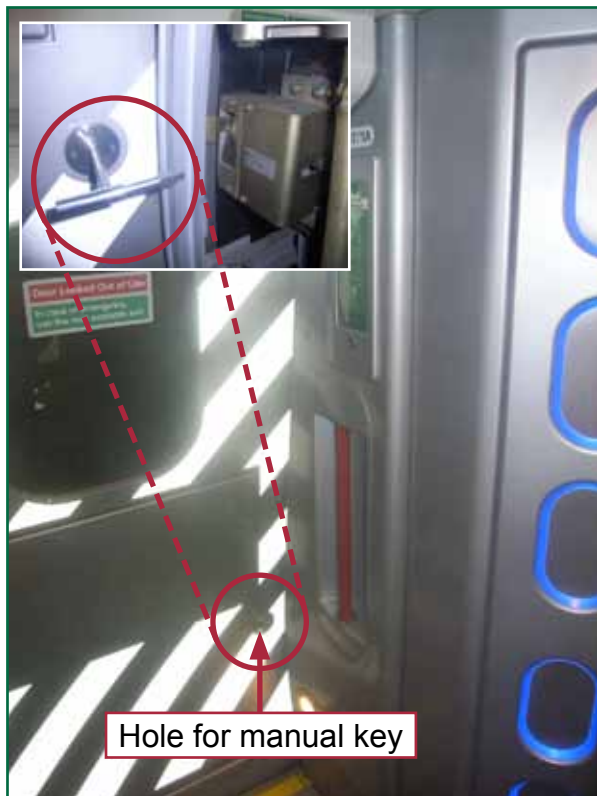
Figure 2: Internal view of door (Inset: Close-up of key in door, and bolt engaged (panel removed to show mechanism))