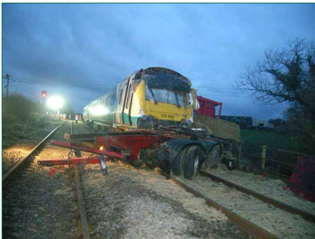
Figure 1: The train and lorry where they came to rest after the accident (most of the straw has been removed)