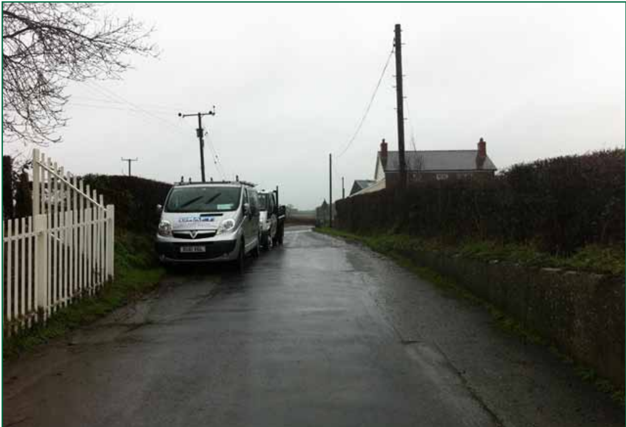
Figure 4: Road on the north side of Llanboidy AHB crossing showing parked vehicles