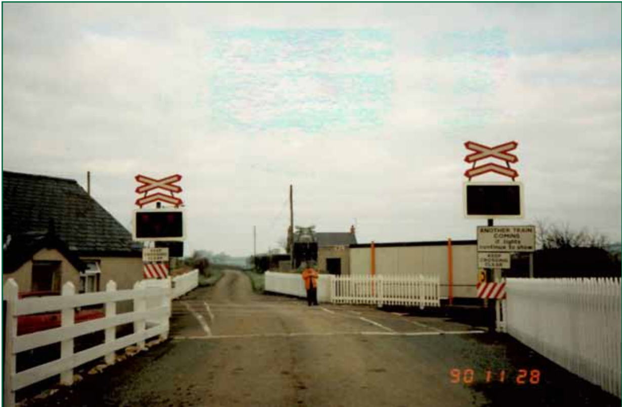
Figure 8: Llanboidy crossing as an AOCR in 1990