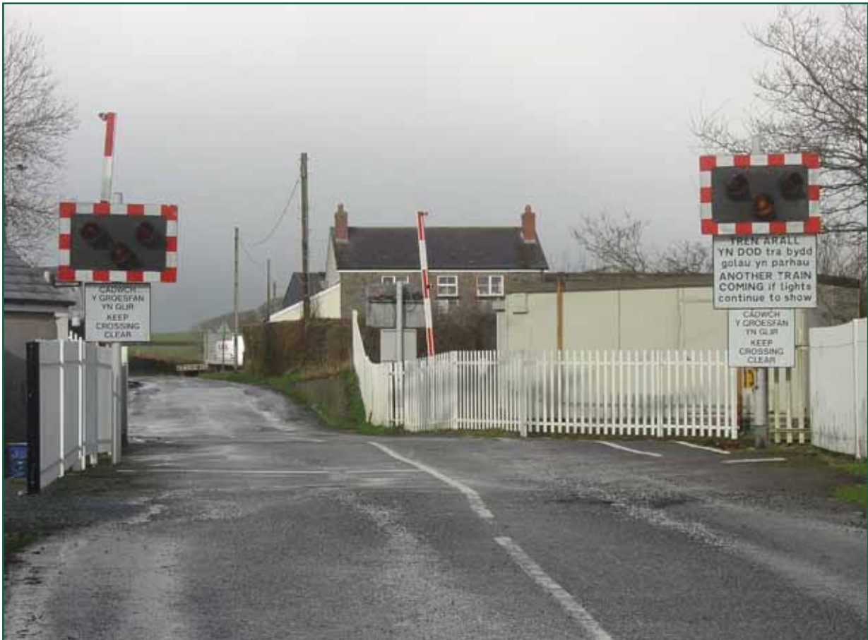
Figure 9: Wig wag signals at the south side of the crossing