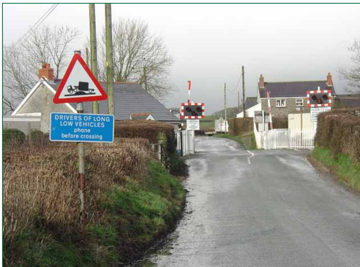
Figure 6: Uneven road warning sign on approach to crossing