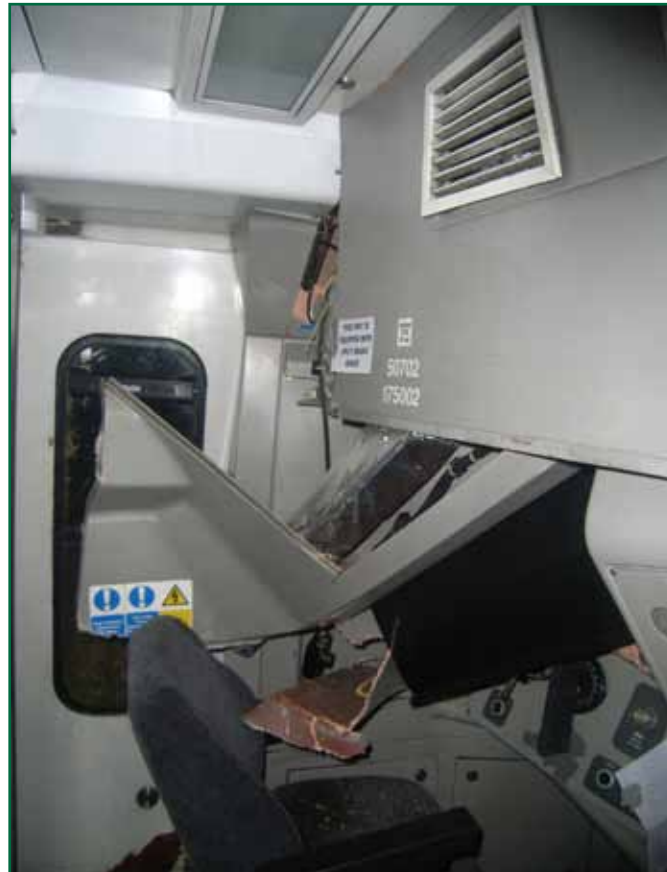
Figure 10: Driver's seat showing position of GRP panels after collision

56 In the collision, the steel structure remained undamaged as the collision forces were not high enough to deform it. However the GRP skins became detached from the steel structure as they were hit by the lorry's load which pushed the skins towards the inside of the cab. Parts of the inner GRP skin intruded into the area around the driver's seat and compromised his survival space. It is likely that he would have sustained injury, had he not left the cab before the collision (figure 10). It should be noted that GM/RT2100 Issue 5 and the TSI, by reference to European Standard EN15227 ' Railway Applications – crashworthiness requirements for railway vehicle bodies ', now includes a specific definition of, and requirement for, a driver's survival space. This requires that deformation of the structure does not cause any vehicle equipment or parts to encroach into the designated survival space during the specified collision scenarios. RAIB calculations accounting for deformation of the obstacle showed that the collision scenario at Llanboidy was less severe than any of the EN 15227 scenarios for level crossing collision at a comparable speed.