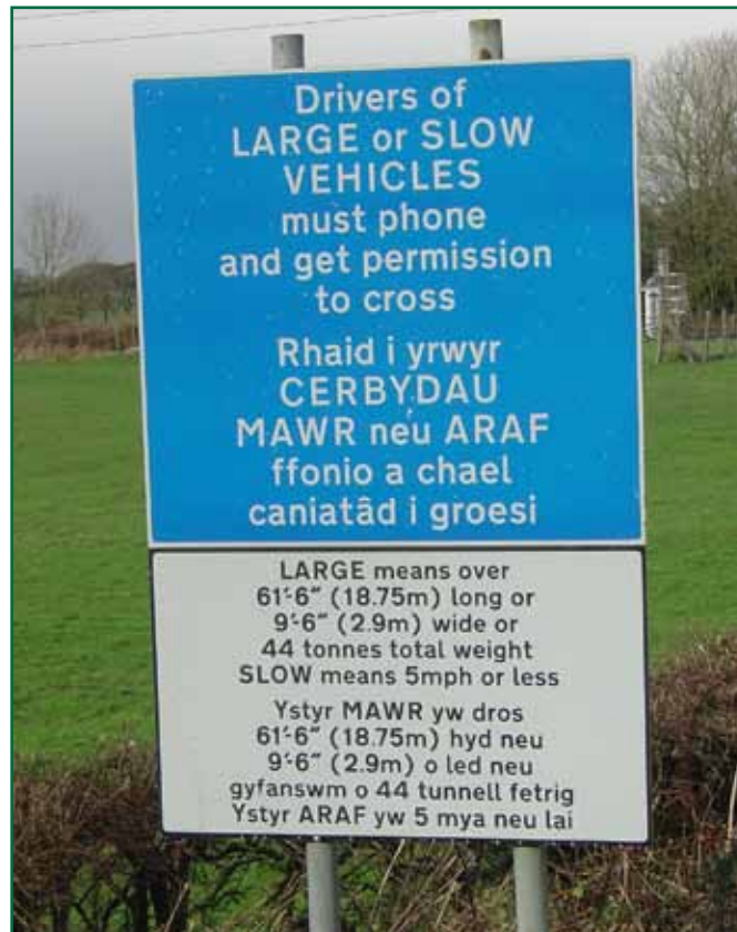
Figure 5: Sign reminding drivers of large or slow vehicles to call signaller