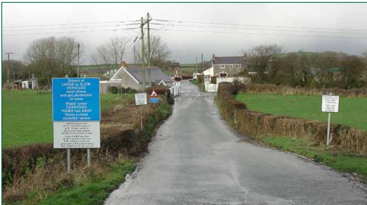
Figure 3: South approach to Llanboidy AHB crossing