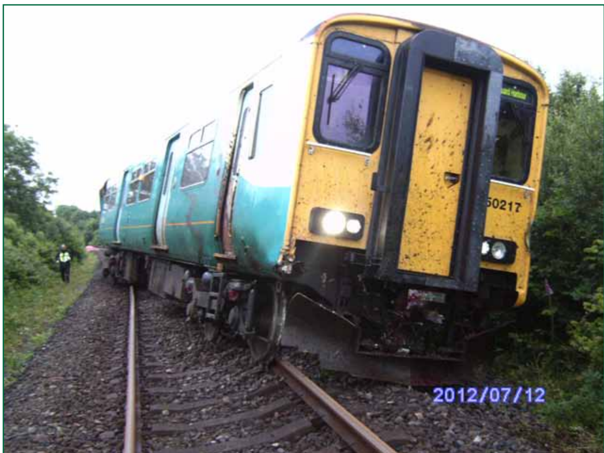
Figure 2: The train after the accident