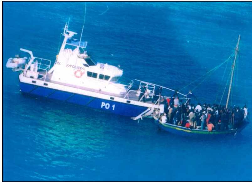
Figure 2

The sloop involved in this accident was representative of other sloops ( Figure 2 ) used to run economic migrants from Haiti to the Turks and Caicos Islands, and similar sloops attempting to land migrants into the USA have been intercepted by the US Coastguard. While only a few previous cases of capsizing have occurred, the sloops are known to be unstable when the majority of the passengers are on deck. This movement of passengers starts as the sloops near their destinations, but is also triggered when they are intercepted by the authorities.