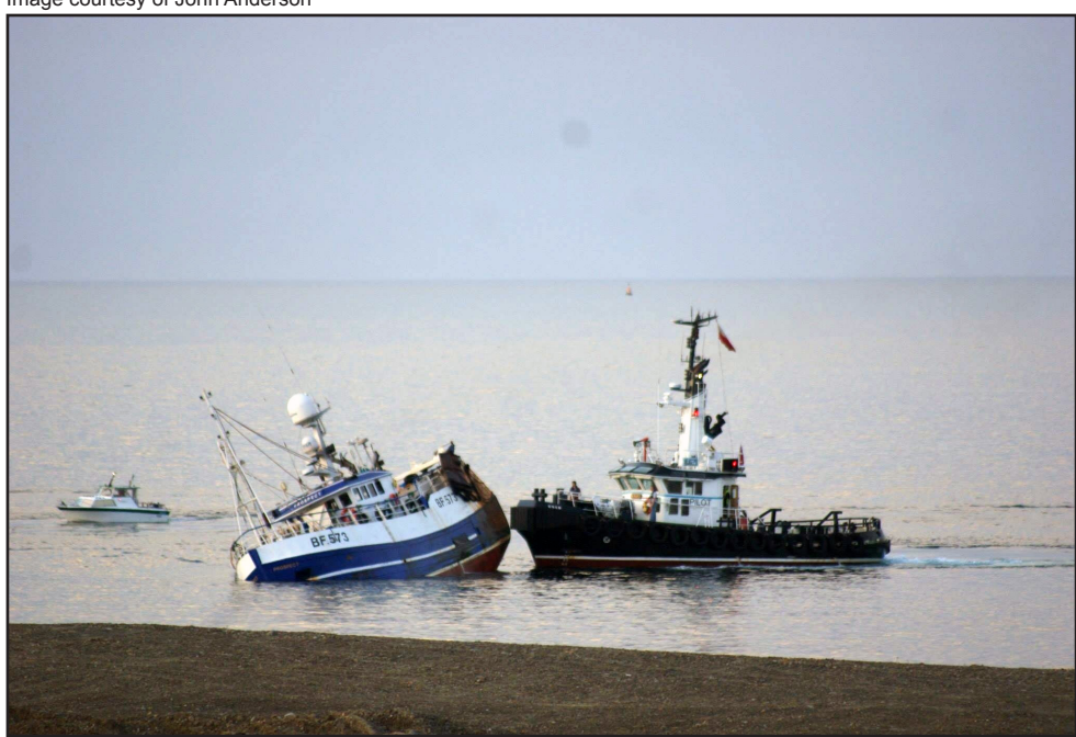
Figure 3: Knab pushing Prospect into shallow water