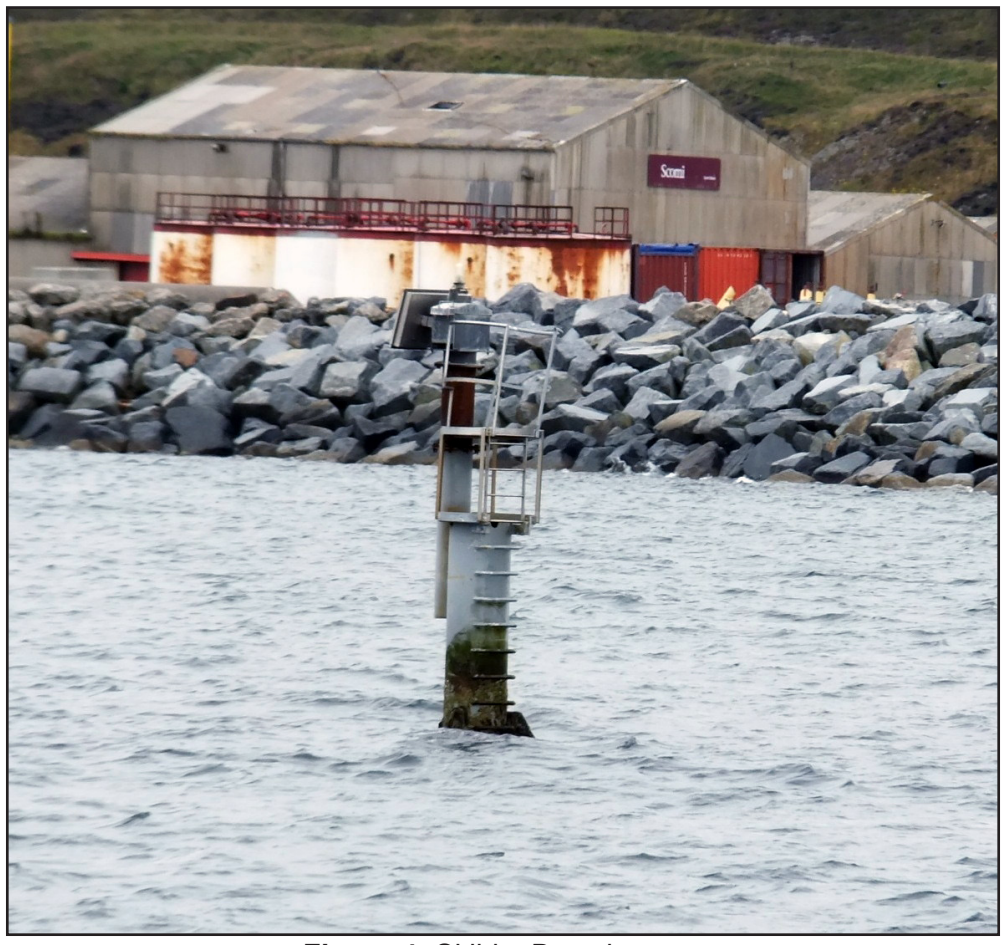
Figure 4: Skibby Baas beacon

Marine Guidance Note (MGN) 313 (F) – Keeping a Safe Navigational Watch on Fishing Vessels identifies the danger of distraction, It also reiterates the requirement for proper voyage planning and monitoring, and includes guidance on the use of navigation equipment, specifically: