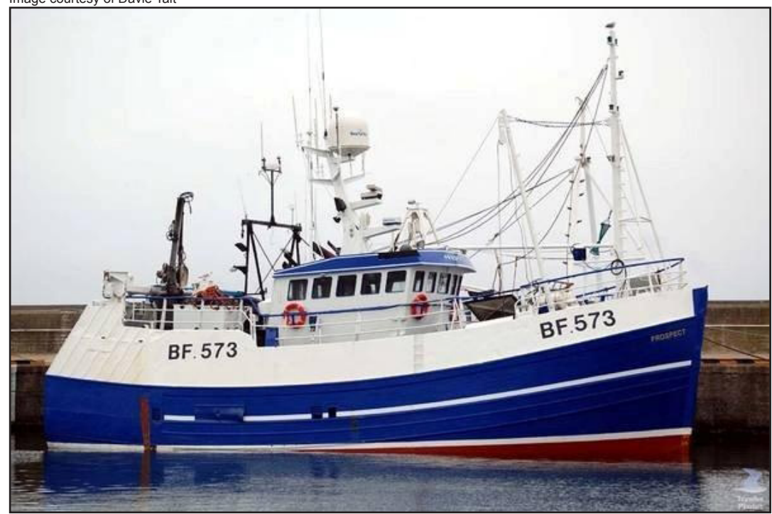
Figure 1: Prospect