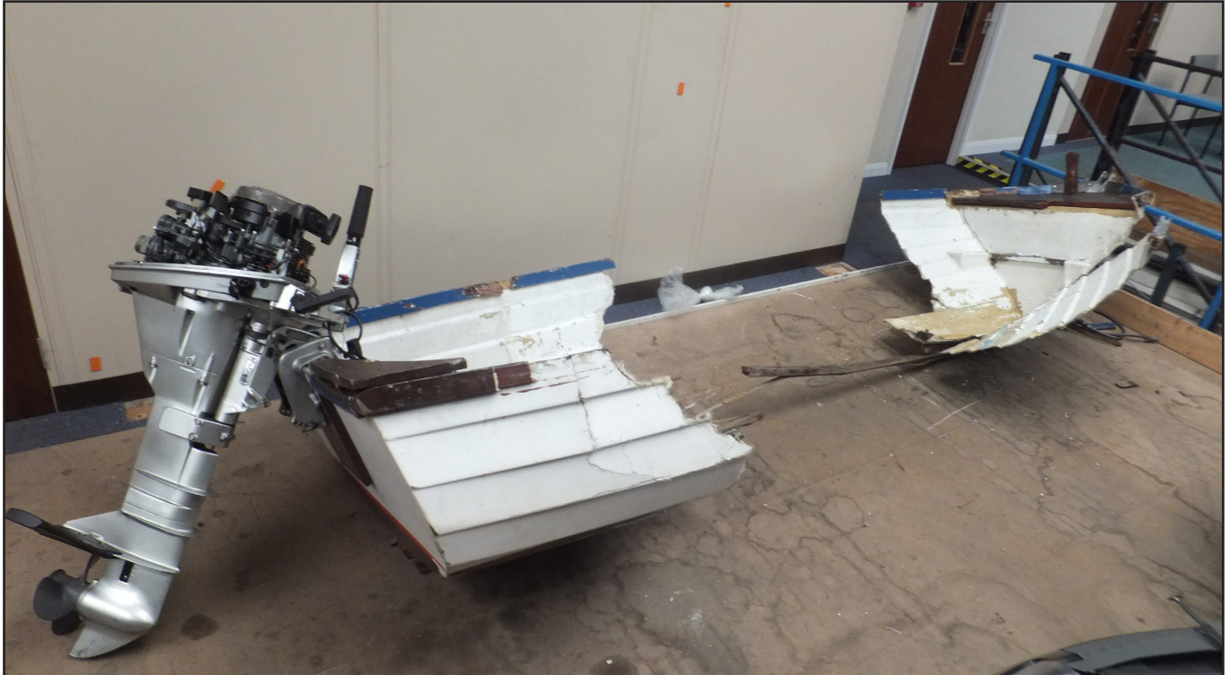
Figure 3: Amy Jane recovered sections

When the fore and aft sections of the boat were recovered by the lifeboat crew, its outboard engine was still attached to the transom ( Figure 3 ). A 1.2m central section of the hull and the outboard engine's top cover were missing. The engine cover lock lever was found to be very stiff and was difficult to operate. The engine kill cord 8 was still connected to the kill switch and was wrapped around the engine mounting frame. The engine gear selector was in the 'ahead' position with the throttle set to about 75% ( Figure 4 ). The steering friction adjuster 9 was slack and the engine was very loose to turn on its mounting.