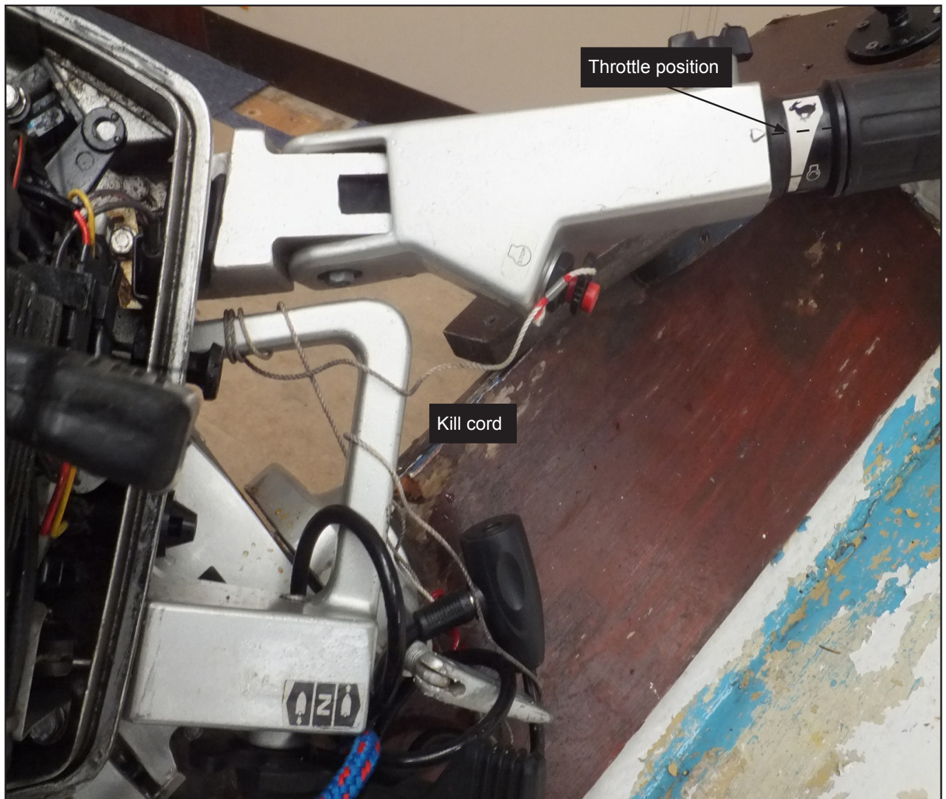
Figure 4: Kill cord and throttle