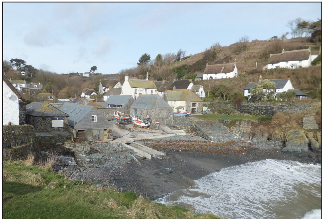
Figure 1: Cadgwith beach

It is unknown when, and what caused the single-handed sea angler to fall overboard, but it is almost certain that he entered the water while Amy Jane was