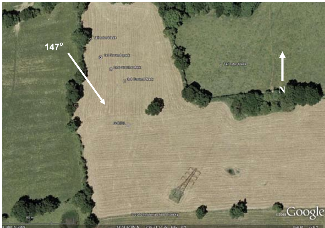
Figure 2 Accident site

The impact sequence resulted in the right side of the cockpit being deformed inwards. This also caused deformation of the cockpit bulkhead on the right side and crushing of the right side of the pilot's seat mounting structure. The magneto switch was found in the OFF position but it was later confirmed that the emergency services had turned the key from the BOTH position to the OFF position during their rescue attempt. The carburettor heat selector was also found in the OFF position, although it could not be established whether it had been moved after the accident.