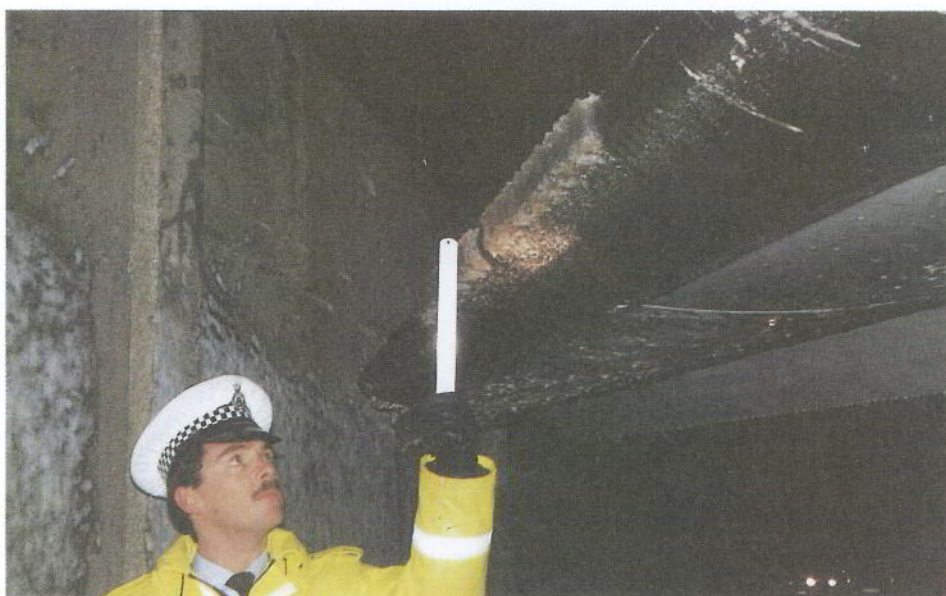
2. Right tailplane