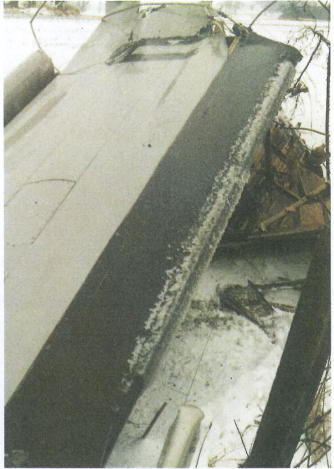
5. Left outer mainplane