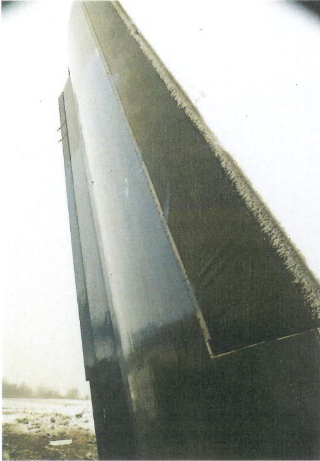
4. Fin and rudder