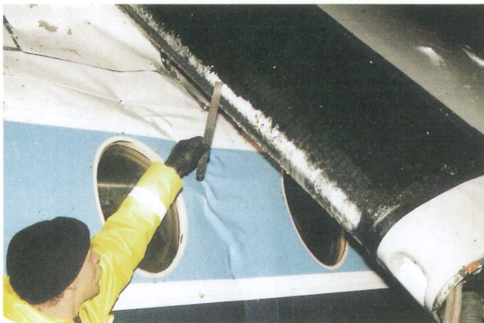
3. Left inboard mainplane