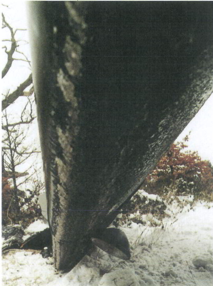
6. Right outer mainplane