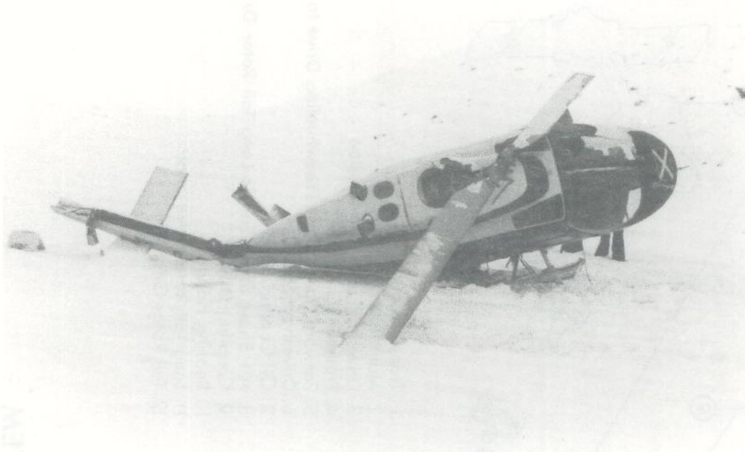
1. Main Wreckage