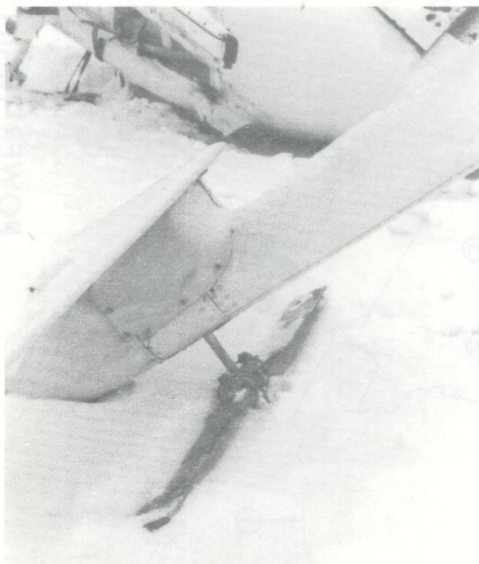
2. Tail Rotor Assembly