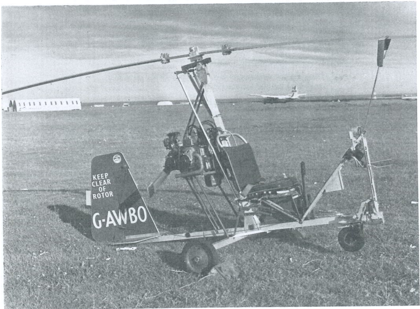
BENSEN B8M. GYROCOPTER