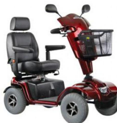
Figure 2.2: Roma Granada