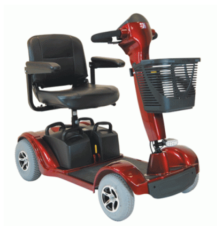
Figure 2.1: Roma Sorrento