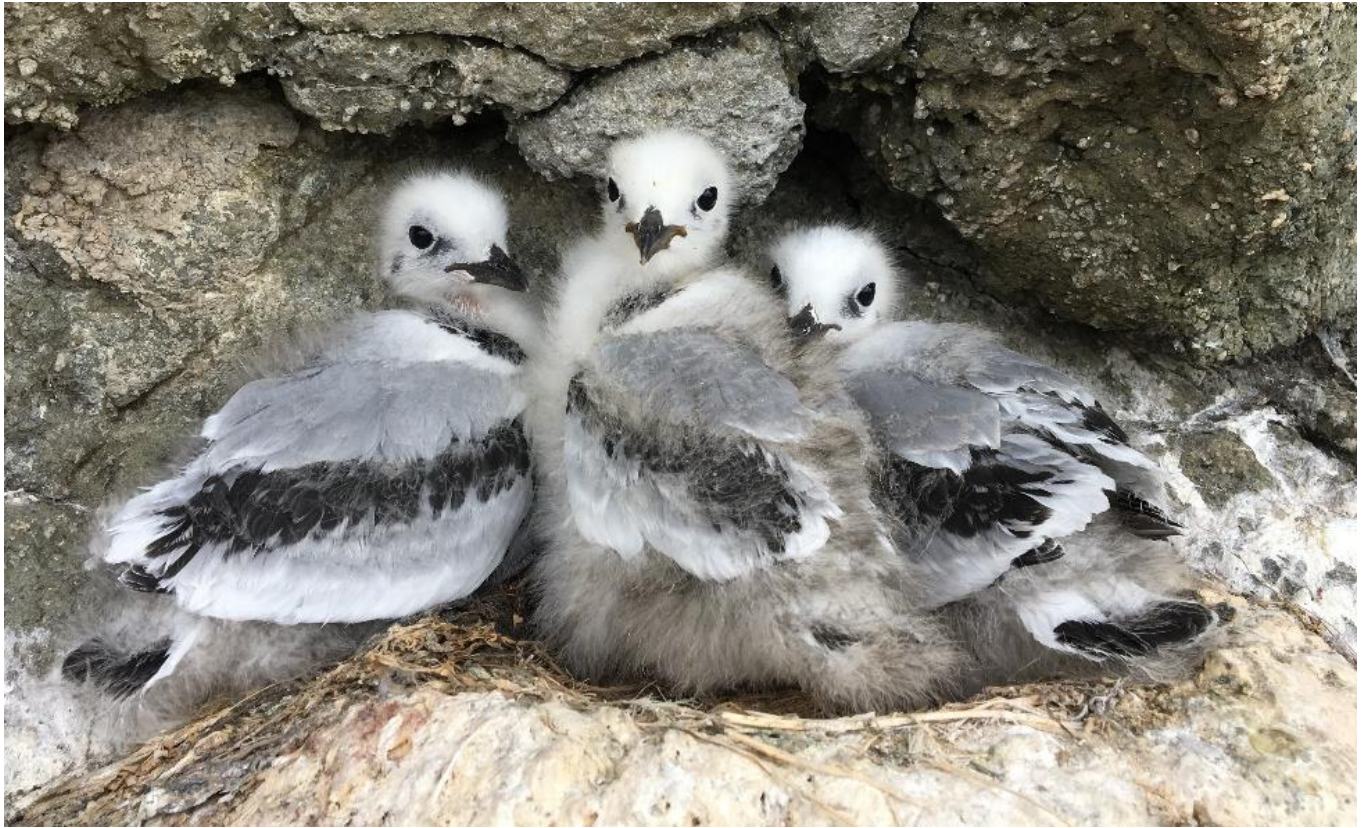
Figure 4. Large kittiwake chicks in the nest – diagnostic features include black tip to tail, dark markings across the wings, a black neck band and a black bill. You can also see the white head and body and light grey wings and back. Younger chicks are uniformly grey, lacking the dark plumage features and have a downier appearance. Once fledged, juvenile kittiwakes retain the black plumage features until their second year (Figure 3).