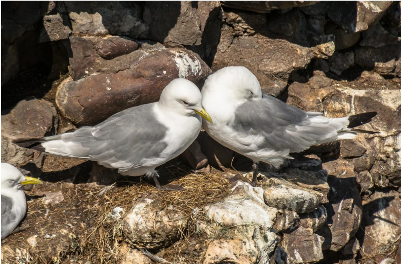
Figure 7. Example of a trace nest with two adults in attendance. An attempt to gather vegetation has been made but the nest is incomplete and incapable of holding eggs.