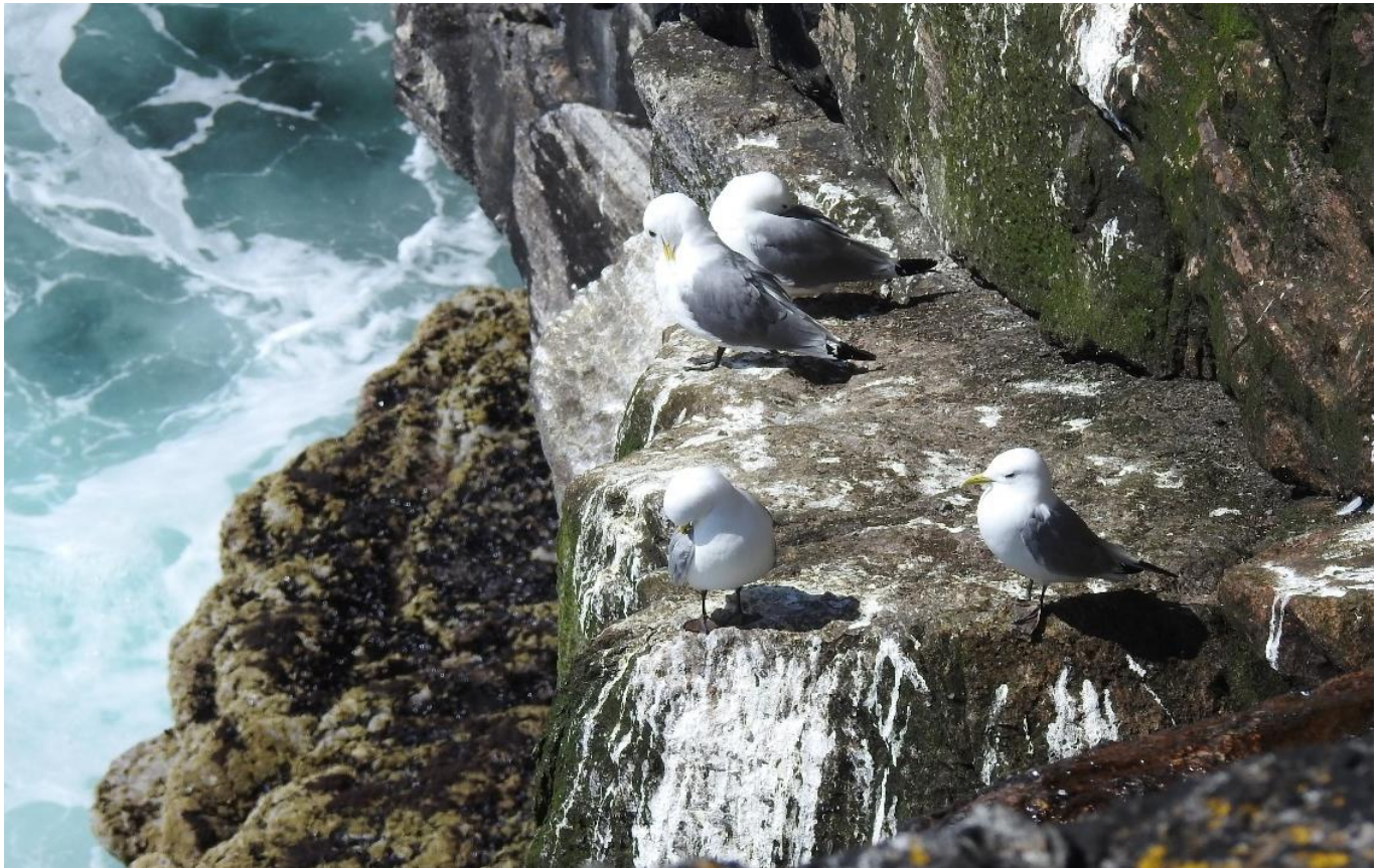
Figure 5. Kittiwakes roosting on a rocky ledge.

Roosting is when birds settle to preen, rest or sleep at any point during the day. They may do this individually or they may gather in flocks. Roosting kittiwakes will be on surfaces away from the nest site (Figure 5). On offshore platforms, this is likely to be on the installation structure/surfaces. Roosts can be ephemeral and may consist of both non-breeding and breeding birds. If birds are just roosting on an installation then there will be no evidence of nests. Areas used by birds for roosting only are not legally protected and a wild birds licence is not required if birds are only roosting on an installation.