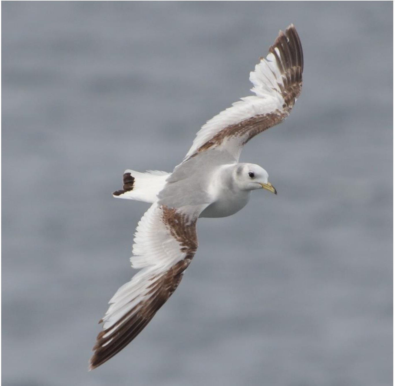
Figure 3. Immature kittiwake – diagnostic features include black tip to tail, dark ‘M’ markings across the wings, a dark neck band, a dark smudge behind the eye and black legs. Bill may also show some dark markings. Lower body and head are white. The bird shown in the photo fledged in the previous summer. Recently fledged juveniles will have a black neck band (as opposed to the grey shown in the photo), the dark ‘M’ wing markings will be black (as opposed to brown shown in the photo) and the bill will be fully black with no yellow.