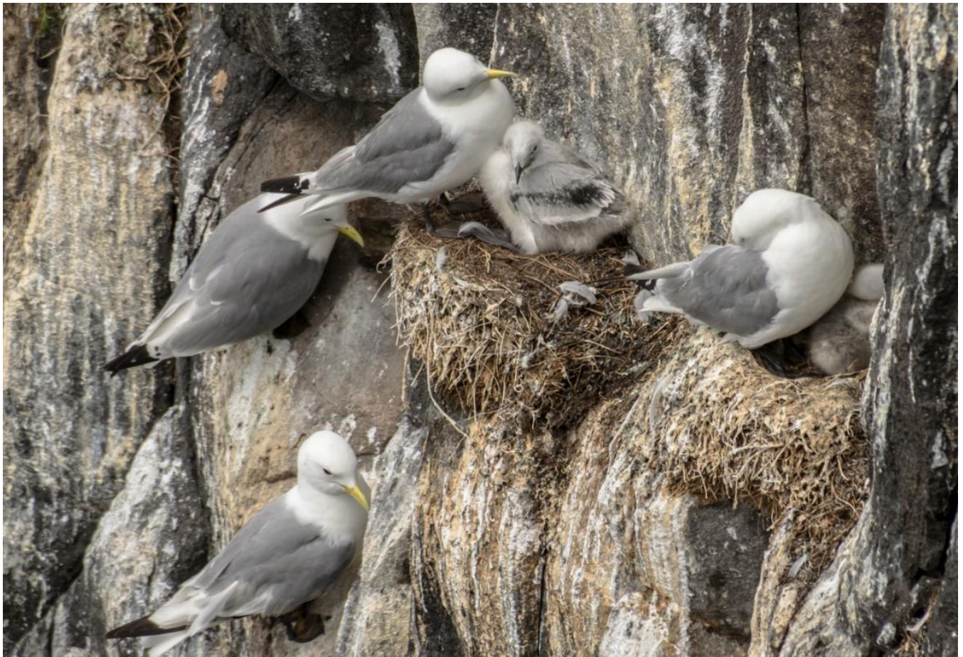
Figure 6. Each year, kittiwakes build substantial nests of vegetation which may degrade over the course of the breeding season. An older chick with dark markings is in the left nest (top middle of photo) whilst a younger, downy chick is just visible in the right nest (far right of the photo).

The recommended unit for surveying and monitoring kittiwakes is the apparently occupied nest (AON), defined as a well-built nest capable of containing eggs, with at least one adult present (Figure 6). Poorly built 'trace' nests (Figure 7) with adults in attendance are more likely to be made by birds that won't go on to breed ('non-breeding birds'); however a high proportion of trace nests observed in a survey may indicate a late breeding season (Walsh et al., 1995).