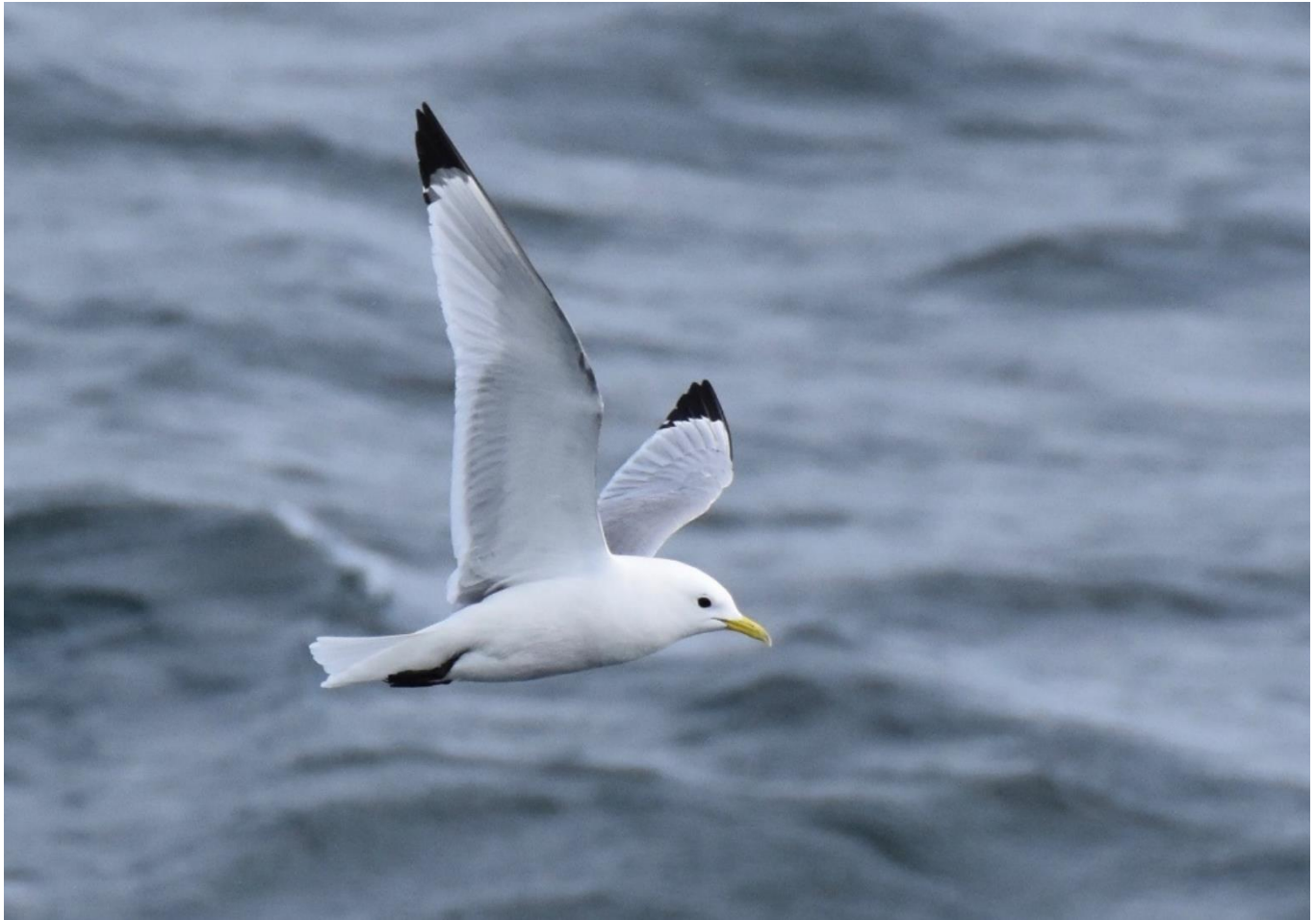
Figure 2. An adult kittiwake in flight in summer – diagnostic features include yellow bill, red mouth, black legs, black wing tips, light grey back and wings, white tail and white head and lower body.