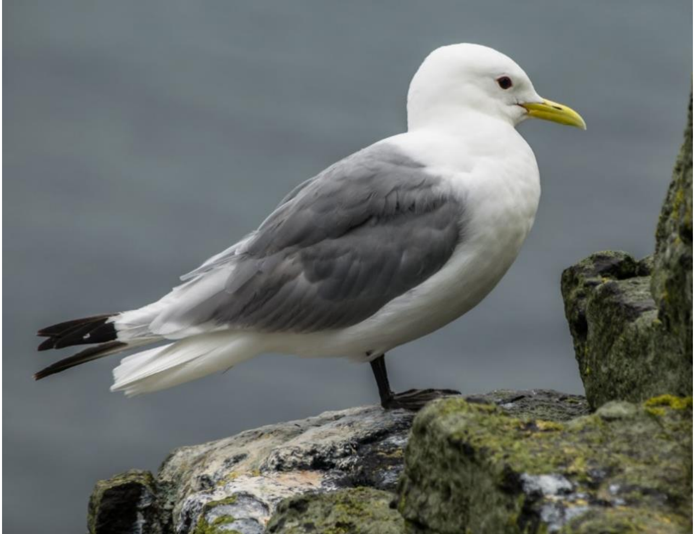
Figure 1. An adult kittiwake in summer – diagnostic features include yellow bill, red mouth, black legs, black wing tips, light grey back and wings, white tail and white head and lower body.

Kittiwakes are medium-sized gulls, with chicks, immatures and breeding adults all exhibiting different plumages. Figures 1 to 4 display the different plumage features of each life stage and detail the key diagnostic features to enable identification. Note that not all features will always be visible when viewing or surveying birds.