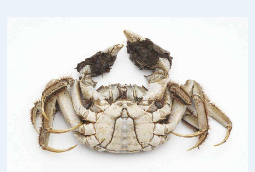
Figure 2: GB Non-native Species Secretariat © Crown Copyright

Native to Eastern Asia, first discovered in the Thames Estuary in 1935