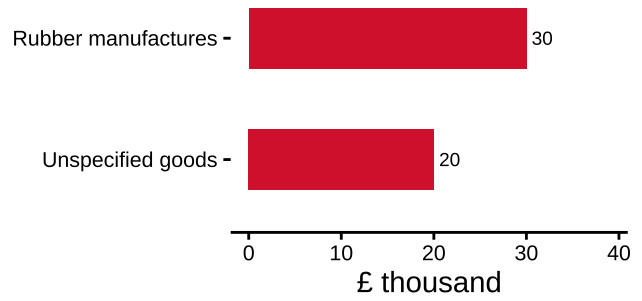
The top 2 UK goods imports, in the four quarters to the end of Q4 2024, from Pitcairn