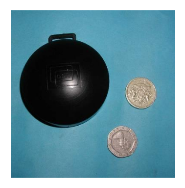
Figure 2: A DRPS ADS radon detector

24. Passive measurement of radon concentrations in situ is the method currently recommended to accurately assess radiation exposures from radon gas. Radon environmental detectors, as shown in Figure 2, are used by DRPS Approved Dosimetry Services (ADS) to assess the radon concentration present in an area. Where measurement is required, the CO / HoE has the responsibility to ensure that radon detectors are requested from DRPS ADS, this request may be delegated to the RSO, WPS (Radon), or other point of contact (POC) representing the site / unit. Radon detectors can be requested by contacting the RPA or ADS directly using the contact detail provided in paragraph 32.