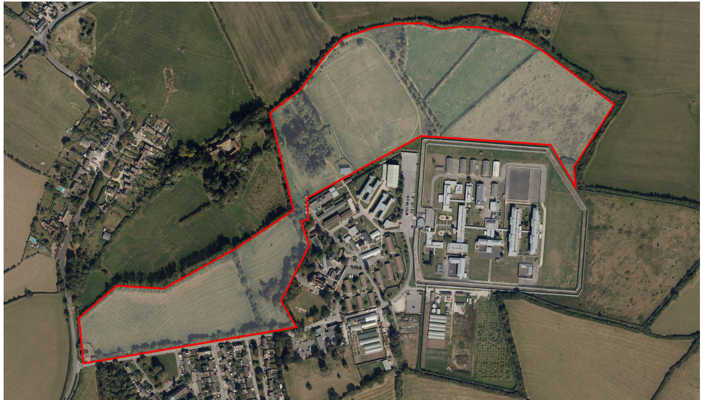
Red line boundary of the proposed development site

The existing prisons are served by bus from Aylesbury bus station which stops on Grendon Road at the foot of the access road, about 10 minutes' walk from the prison (service nos. 5, 16 and 677). The nearest rail stations are Bicester Town Station (trains to and from Oxford), Bicester North station (trains to and from London Marylebone) and Aylesbury station (trains to and from London Marylebone).