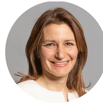
Lucy Frazer QC MP

We recognise that prisoner numbers fluctuate which is why we must have robust plans in place to ensure we always have enough places for those sentenced to custody, and we are very aware of the likely increase in demand for places as the activity of our courts system continues to ramp up to full operating capacity following the national restrictions due to the COVID 19 pandemic. The increasing numbers of police, in line with the Prime Minister's commitment to recruit 20,000 additional officers, is also likely to contribute to a higher prison population, and we therefore believe that creating 18,000 additional prison places will, over the long-term, help to mitigate pressure on prison places in England and Wales in the coming years.