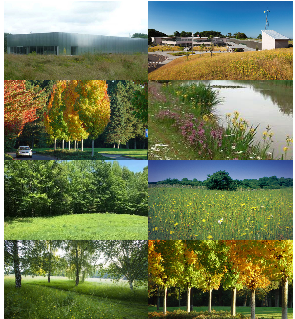
Indicative images of proposed planting and landscaping

So, whilst our proposals are continuing to evolve, we have and will continue to work hard to deliver a new prison with an approach to landscaping that helps it fit within its immediate and wider setting.