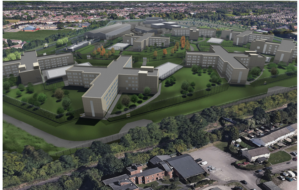
Our new Glen Parva prison in Leicestershire, currently under construction

Our next new prison within the New Prisons Programme will be built next to HMP Full Sutton, in East Yorkshire and will incorporate every element of our new innovative design. This has planning permission already and construction is due to start soon.