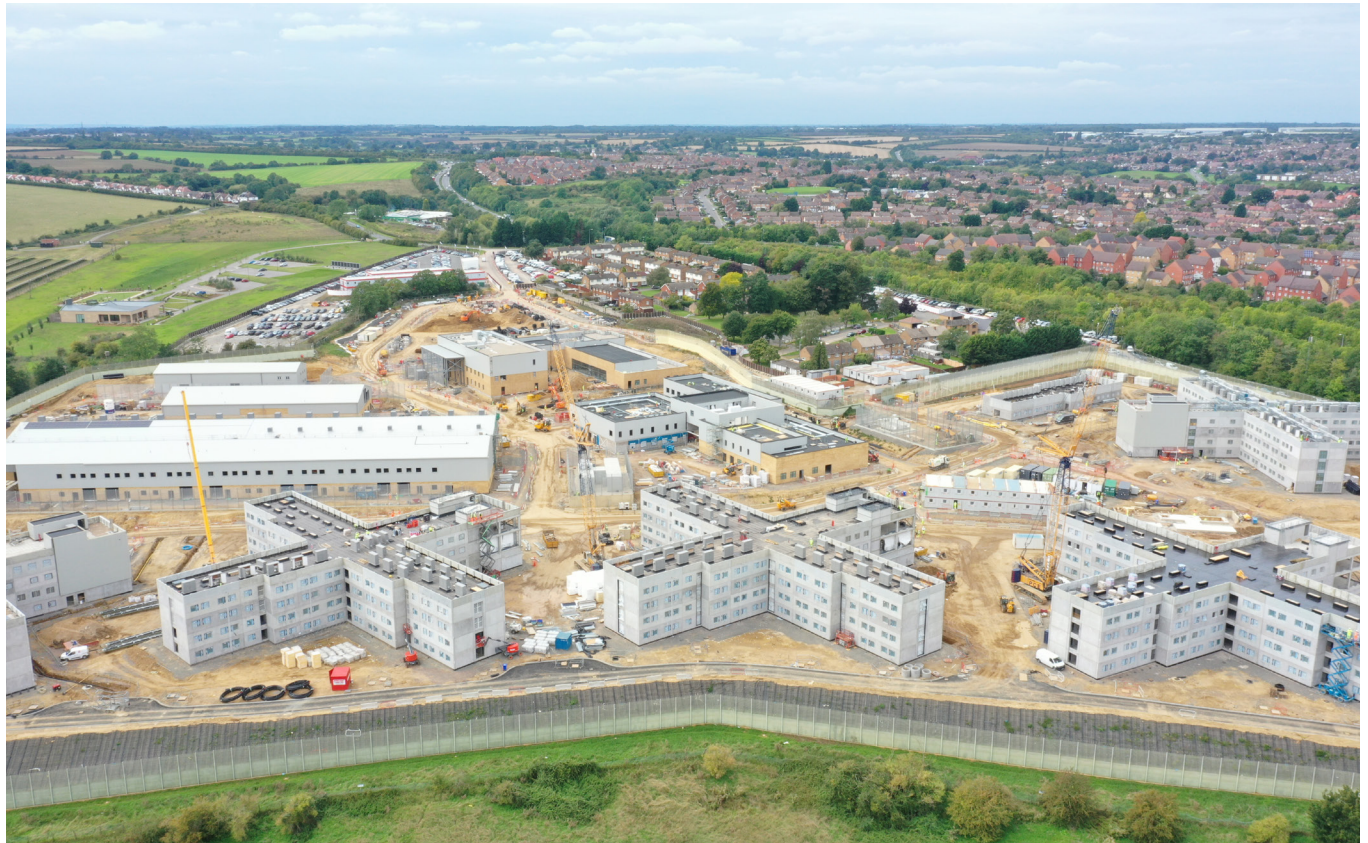
New prison at Wellingborough, HMP Five Wells, under construction

We recognise the local community will be interested in seeing the new prison site layout plans and what they look like. To assist with this understanding, we have included a couple of indicative sketches, the site plan and a landscape plan in the following pages.