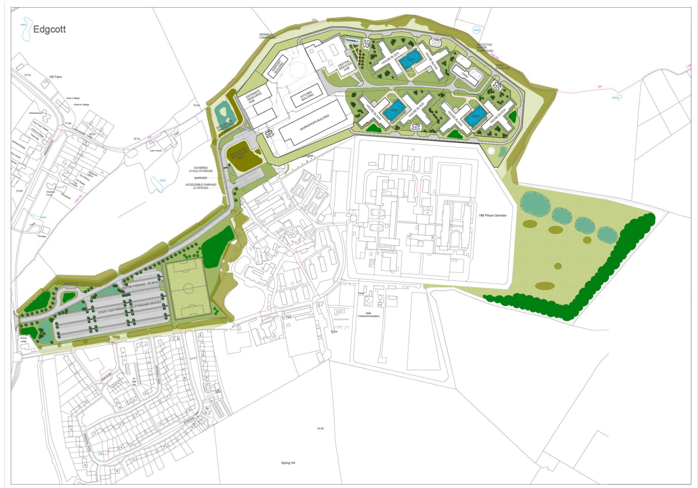
Indicative site plan of the proposed new prison

The image to the right shows our current indicative plans for our new prison. These include the proposed six houseblocks as well as a range of other buildings in the context of the two existing prisons immediately to the south. The image also shows our current overall landscape plan, including planting and green spaces to protect biodiversity across the site.