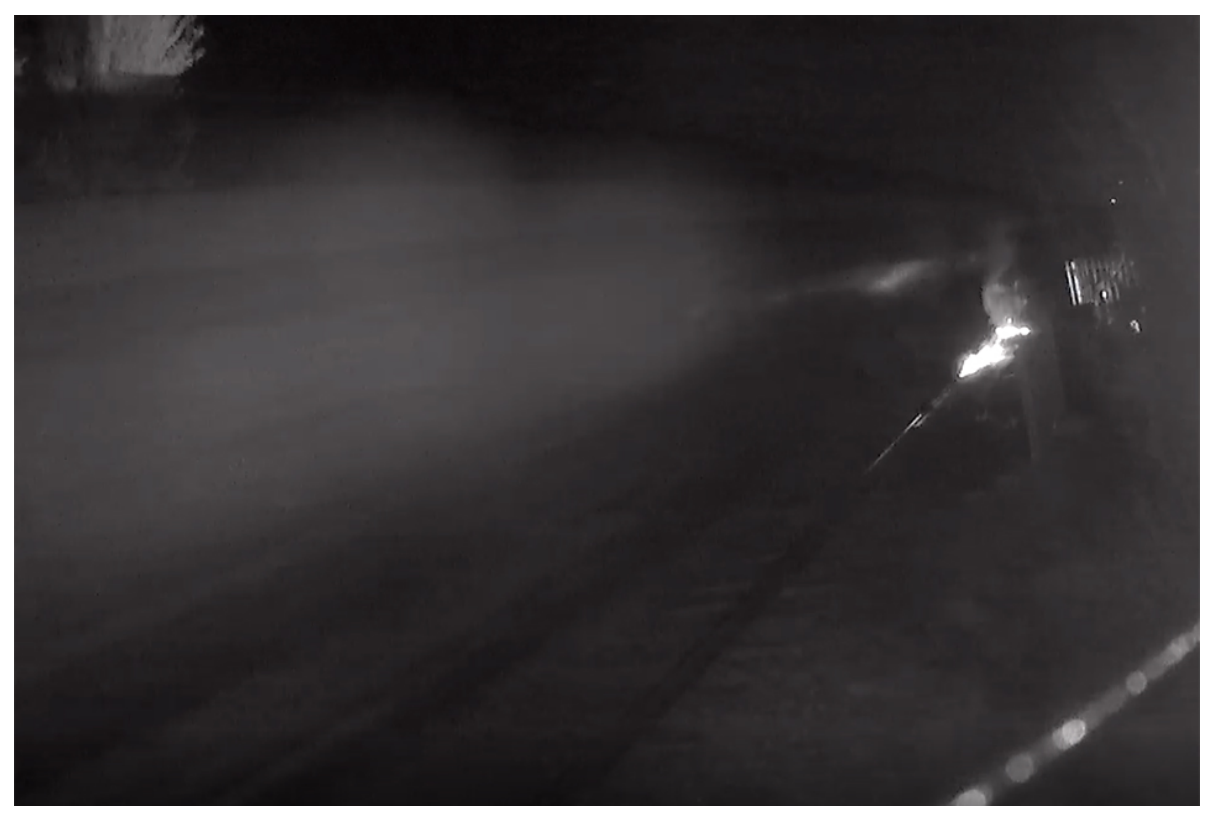
CCTV image showing the third wagon passing Pen-y-Bedd level crossing

RAIB's preliminary examination found that, although all the wheels of the train were probably rotating freely when the train left Robeston, at some point during the journey the brakes on all wheels of the third wagon of the train had become applied, and remained so until the derailment. Although their brakes were dragging, three of the four axles of this wagon continued to turn. At some point in the journey the leading axle ceased to rotate altogether, as evidenced by a CCTV camera located at Pen-y-Bedd level crossing (12 miles (19 km) from Morlais Junction), and marks on the railhead.