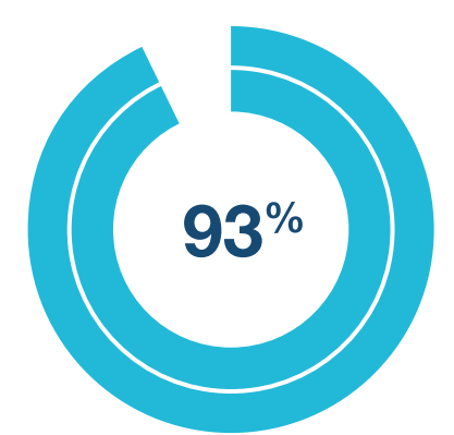
93% of trusts

Auditors concluded that there were no regularity exceptions in accounts for: