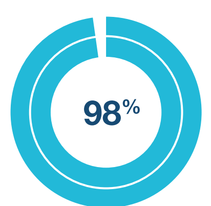
98% of academy trust accounts received unqualifed opinions

It is important that the funds we provide are used by providers for the purposes intended by parliament. Our diverse range of assurance activities have shown high levels of fnancial compliance across 2016/17 and 2017/18. In addition to this routine audit activity, we use a range of information to understand the fnancial health of the sector.