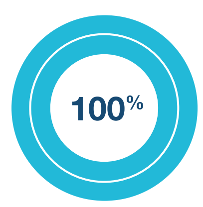
100% of college accounts received unqualifed opinions

Auditors concluded that there were no regularity exceptions in accounts for: