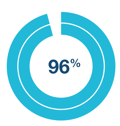
96% of colleges