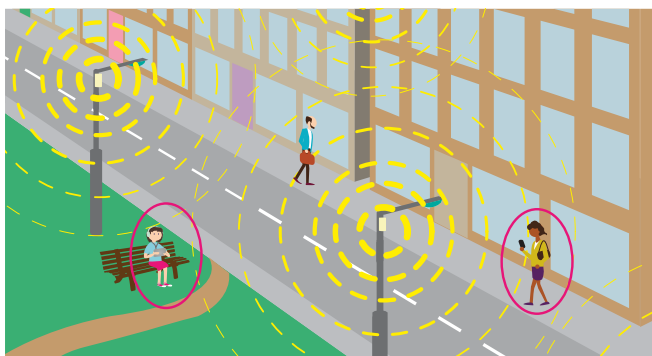
Figure B: Small cell deployment in a city centre

However, a significant increase in the number of small cells is not expected immediately as operators are concentrating on adding 5G technology to their existing sites.