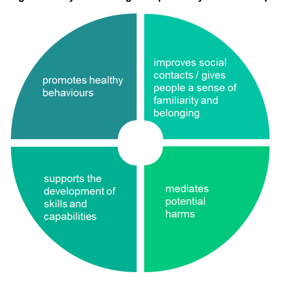
Figure 1: Ways in which greenspace may be linked to positive health outcomes

For all these reasons, improving access to quality greenspace has the potential to improve health outcomes for the whole population. However this is particularly true for disadvantaged communities, who appear to accrue an even greater health benefit from living in a greener environment (5). This means that greenspace also can be an important tool in the ambition to increase healthy life expectancy and narrow the gap between the life chances of the richest and poorest in society (6).