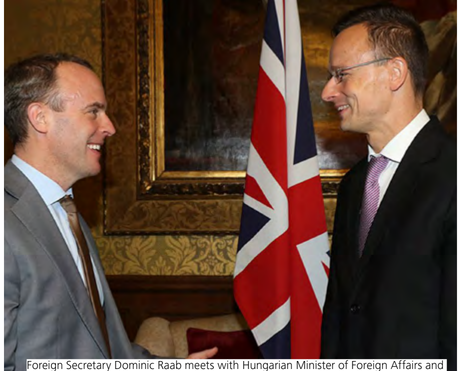
trade Péter Szijjártó to affirm our joint commitment to aiding persecuted Christians & to ensuring the rights of our respective citizens are protected post-Brexit

In Afghanistan , religious and ethnic minority groups were regularly targeted by non-governmental groups, in particular in "Islamic State in Khorasan Province". The rights of minority groups are legally protected