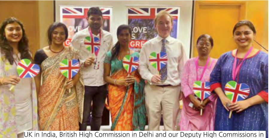
UK in India, British High Commission in Delhi and our Deputy High Commissions in Ahmedabad, Bangalore, Hyderabad, Kolkata and Mumbai celebrated the first anniversary of the Section 377 judgement which decriminalised same-sex relations, September 2019

With a core objective to increase respect for equality and non-