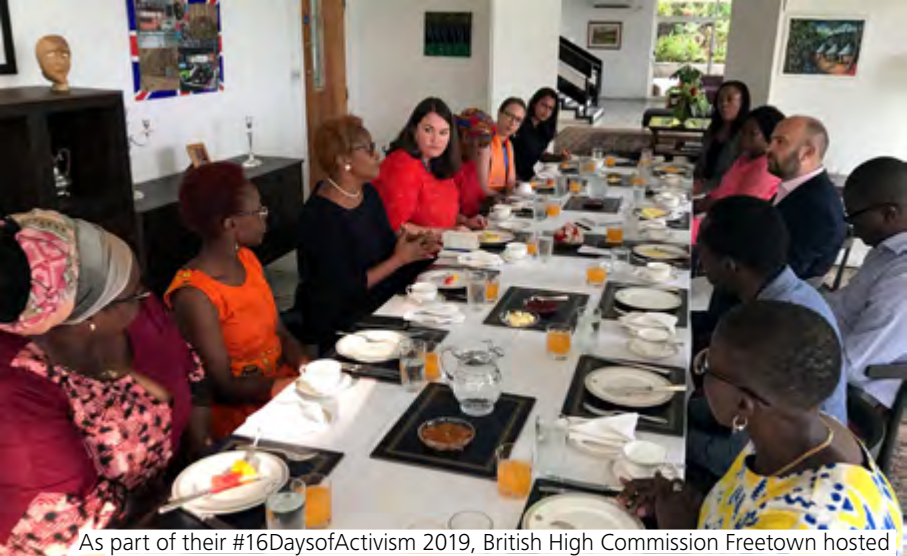
a roundtable discussion on women's rights with female activists and Civil Society

Following the successful 2018 PSVI Film Festival, we funded capacity building for young filmmakers in Goma