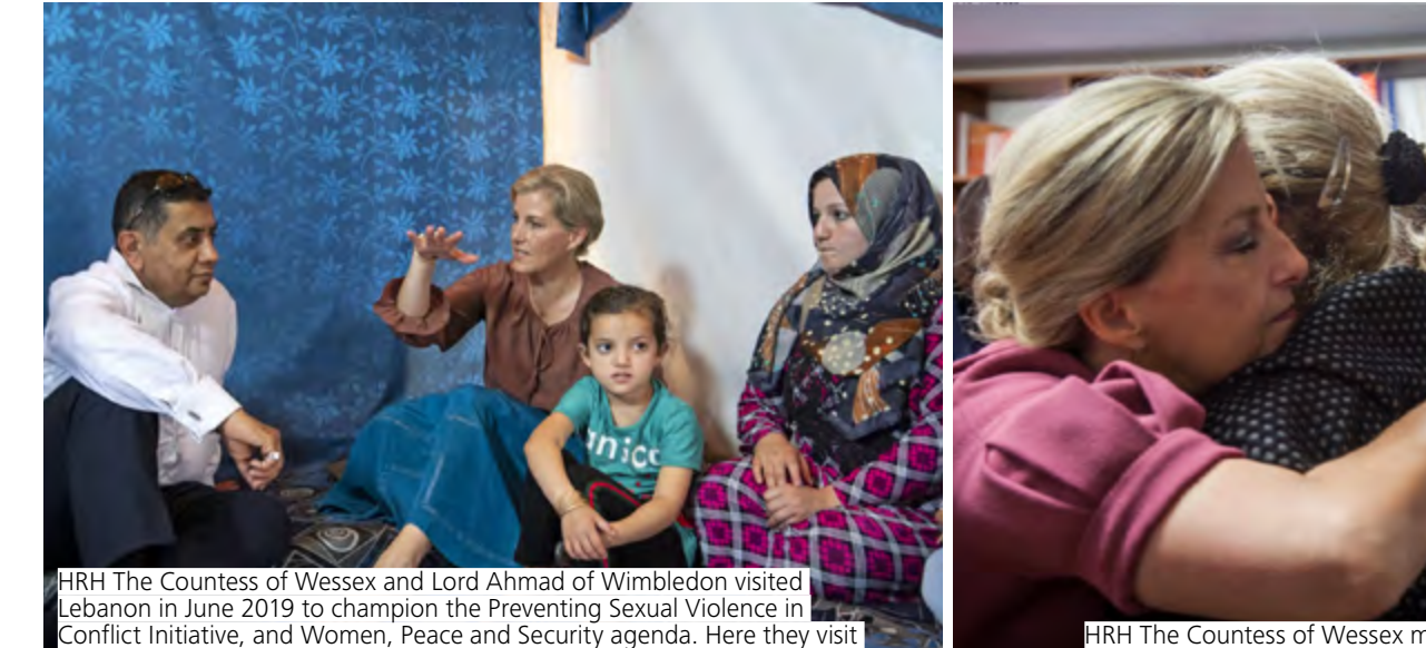
Conflict Initiative, and Women, Peace and Security agenda. Here they visit refugees in the Bekaa Valley, to learn more about their lives in Lebanon.