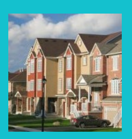
How to assess and allocate sites for development

Find out the principles for allocating sites and the methods that should be applied in order to make sure the sites chosen are the most appropriate for the neighbourhood.