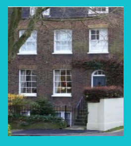
How to undertake a Housing Needs Assessment (HNA)

Find out the principles for allocating sites and the methods that should be applied in order to make sure the sites chosen are the most appropriate for the neighbourhood.