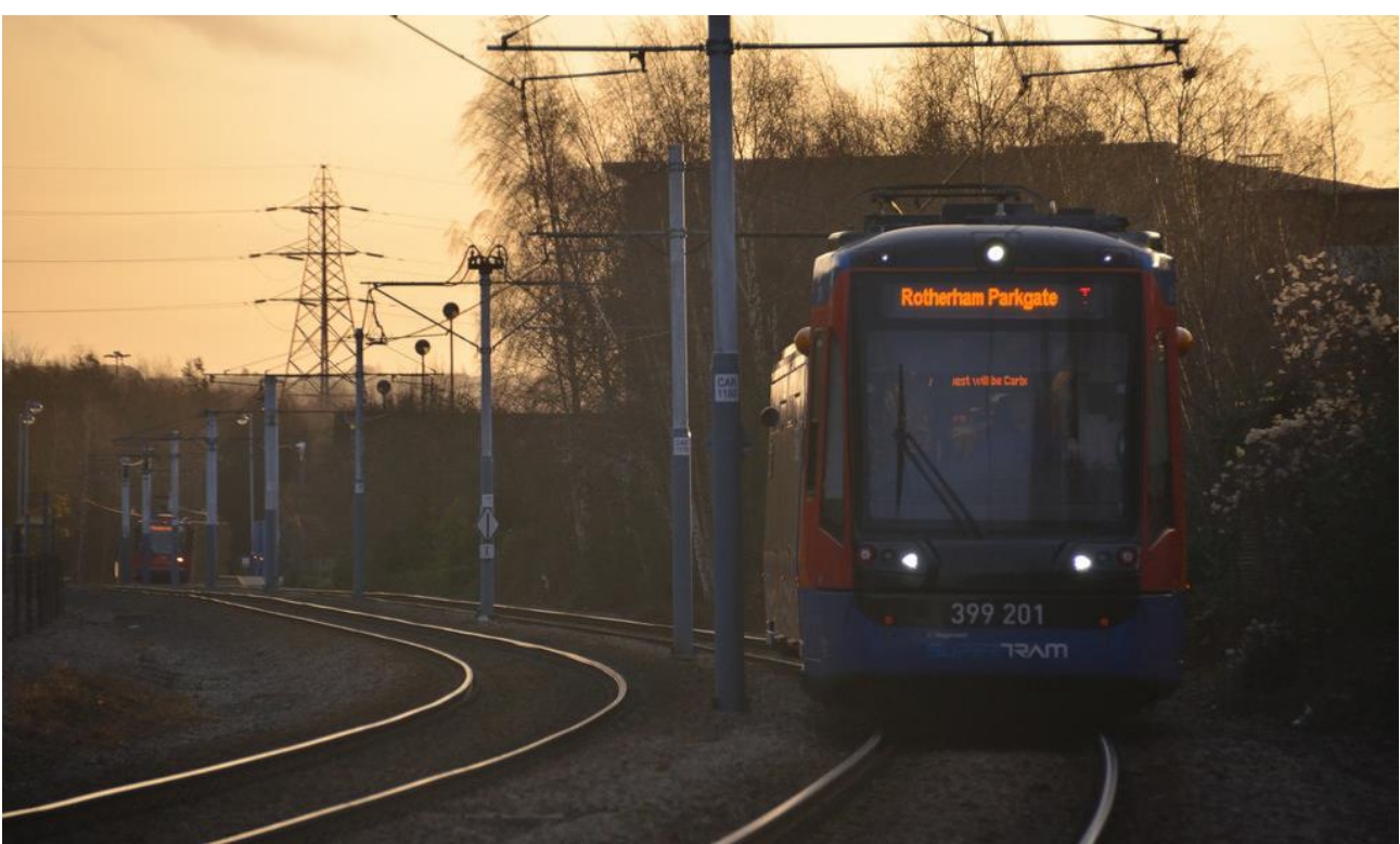
3 the Sheffield Rotherham tram-train trial

Sheffield City Region was awarded £4.2 million in March 2019, to take forward a suite of active travel measures that will better connect towns and villages across South Yorkshire. This includes plans for improved cycle and pedestrian routes connecting Doncaster's town centre, railway station, smaller towns such as Conisbrough and Thorne, and the new growth opportunities at Doncaster iPort; plus a new cycle route from Rotherham town centre that will help establish a sustainable transport link for around 2,400 new homes at the Bassingthorpe Farm site, beyond the town.