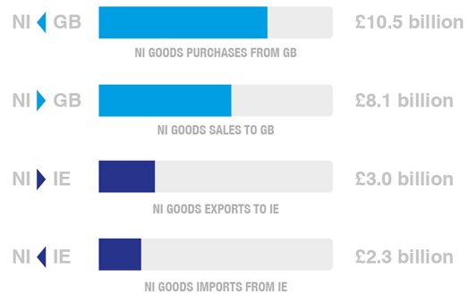
NI-GB AND NI-IE GOODS TRADE AS A PERCENTAGE OF TOTAL NI EXTERNAL GOODS TRADE