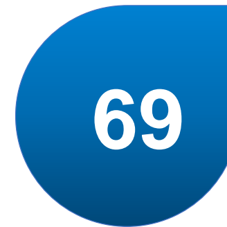
Awards (currently valid)