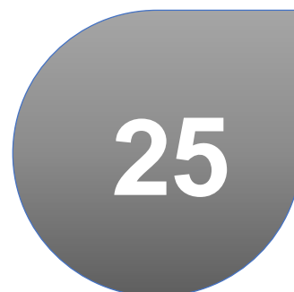
Silver (currently valid)