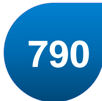
Awards (in 13 years)