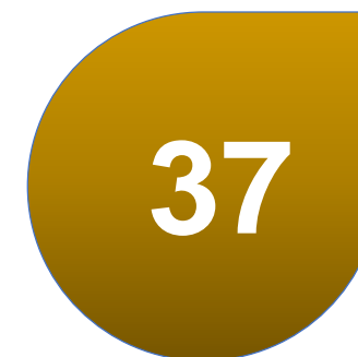
Bronze (currently valid)