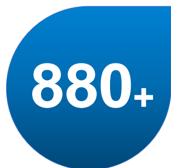
Participants (in 13 years)