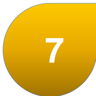
Gold (currently valid)