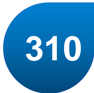
Total active (currently)