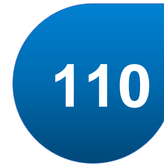
C&G Expressions of Interest