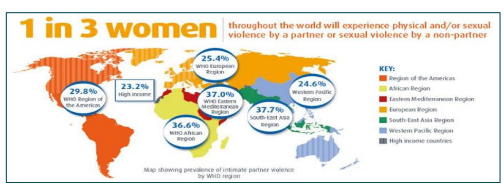
Figure 2: Global and Regional GBV (Fraser and Müller, 2017, citing WHO)

Violence against border traders happens within a broader context of gender inequality<sup>26</sup> and high rates of GBV: globally one in three women and girls experience GBV in their lifetime (WHO et al., 2013); in Africa, this is higher, at 36.6% (see figure 2 below) (Fraser and Müller, 2017). There are important gaps in the evidence around prevalence of GBV in countries in the Horn of Africa – with a recent VAWG Helpdesk study (Fraser and Müller, 2017) finding a lack of national DHS data in Ethiopia, Djibouti, Eritrea, and Somalia. This is in line with findings that there is generally less evidence from fragile conflict-affected and humanitarian settings, though emerging evidence shows that already high levels of GBV are exacerbated in conflict settings – including IPV, and sexual violence by armed actors and perpetrators known to the victim (Fraser and Müller, 2017).