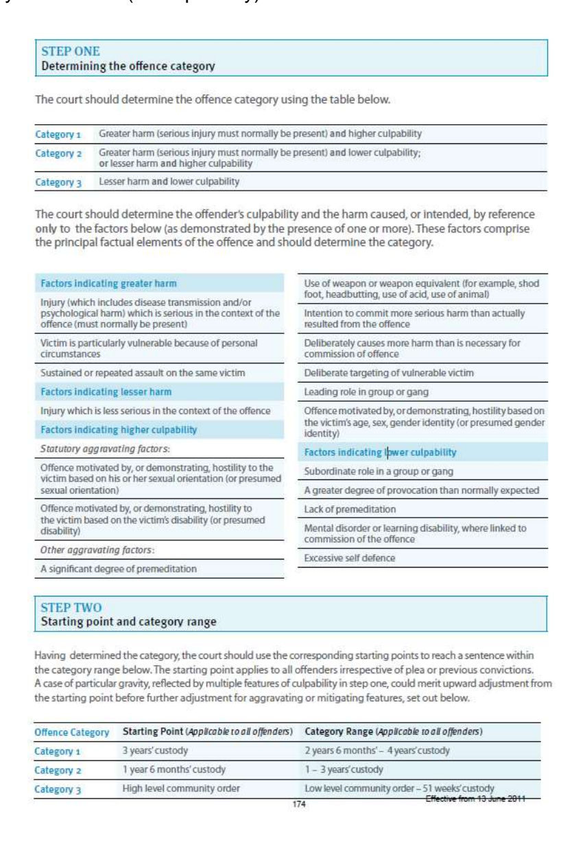
Fig 2 – New Style Guideline (Example only)