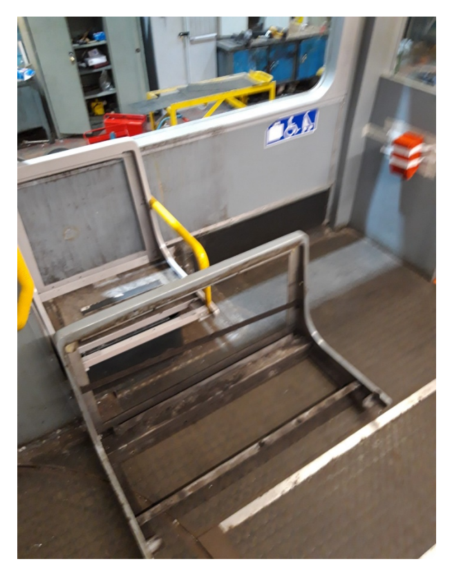
Figure 1 Extra wheel chair space created by removal of double seat