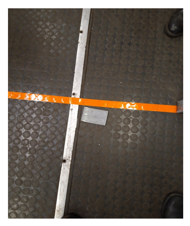
Figure 3 Contrasting floor covering for vestibule areas

Having made the above improvements, and taking into account the exemptions previously granted to the rest of the fleet, I am of the opinion that all reasonable adjustments will have been made to allow the Metro cars 4001, 4002, 4040 and 4083 to enter passenger service under an exemption to RVAR 2010, pending arrival of the first of the new fleet in 2025.