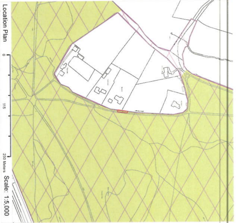
Location Plan 0 115 230 Meters Scale: 1:5,000