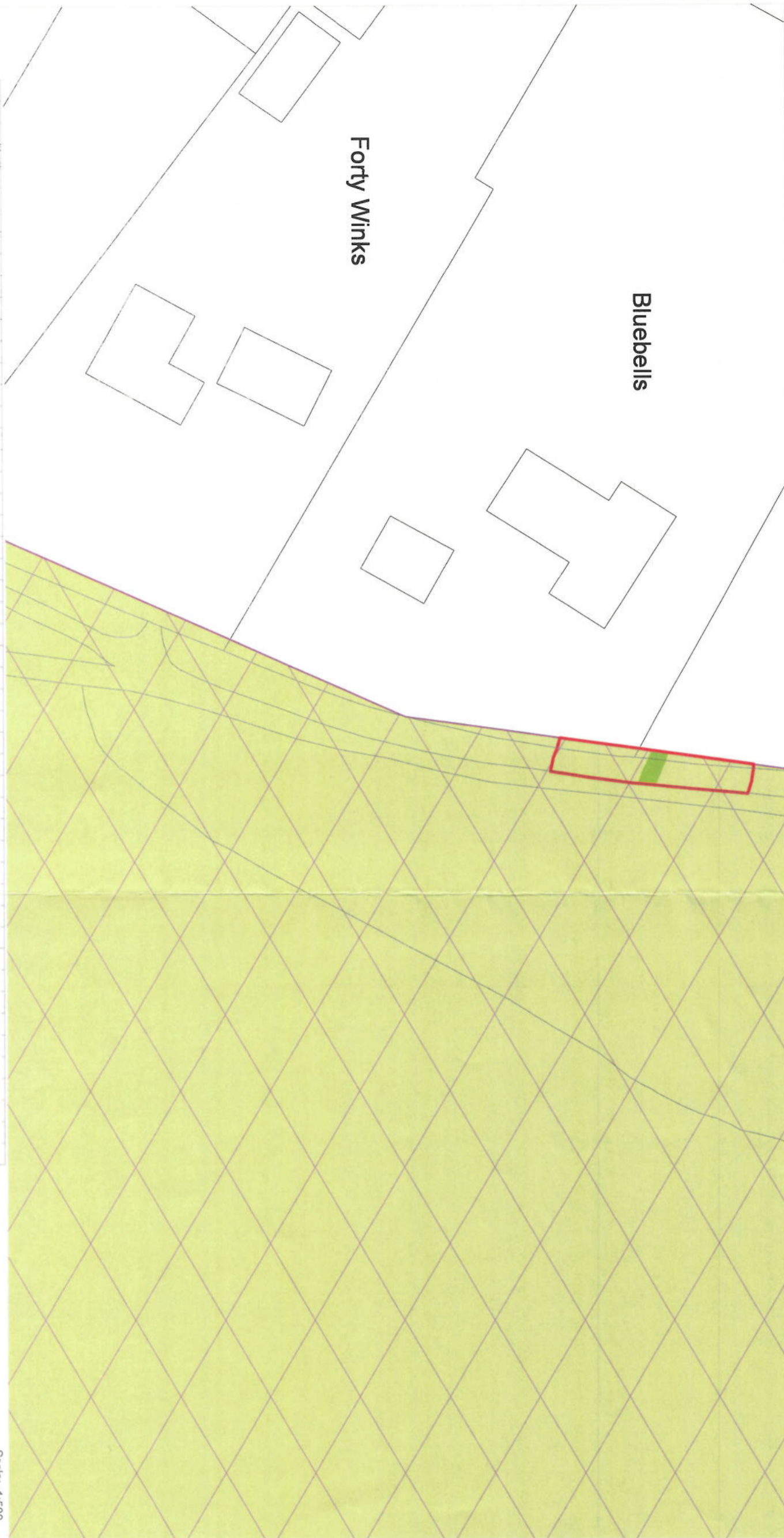
Site Plan 0 25 50 75 100 125 Meters Scale: 1:500