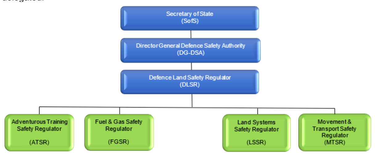
Figure 1: DLSR Safety and Environmental Delegations