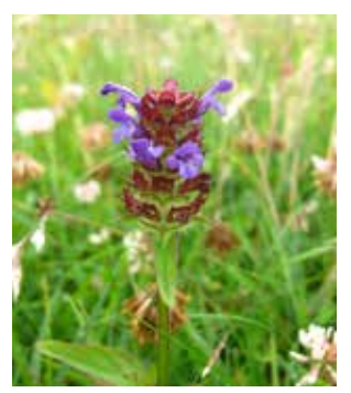
Pictured top left to right; Bee Orchid, Northern Marsh Hybrid, Self Heal and bottom right, Yellow Rattle