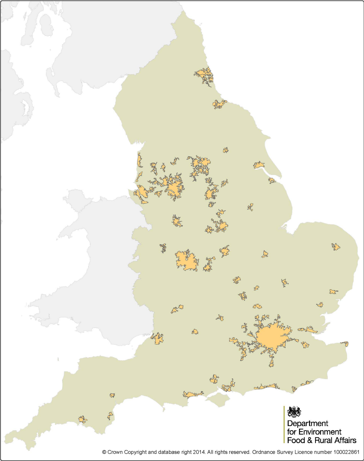
Figure 1. Agglomerations in England