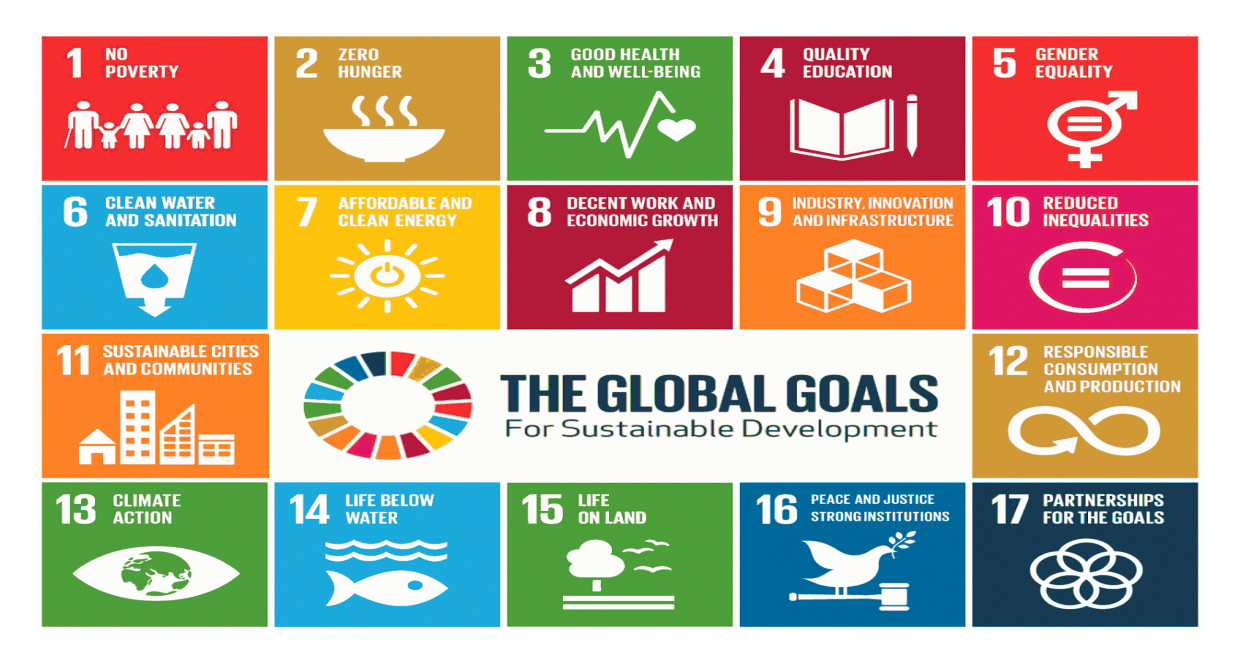
UN Sustainable Development Goals