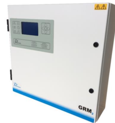
Refrigeration system controls

For more information see: Carbon Trust's Refrigeration systems technology guide (CTG046) .