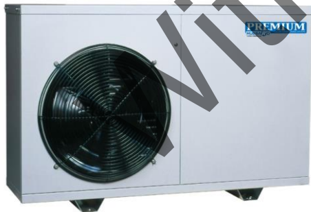
Cellar Cooling

ETL listed refrigeration equipment must meet defined energy efficiency levels under various load conditions. In this document, the baseline scenario below, has been used to calculate the potential financial (£), energy (kWh) and carbon savings (tonnes CO 2 ) unless otherwise indicated: