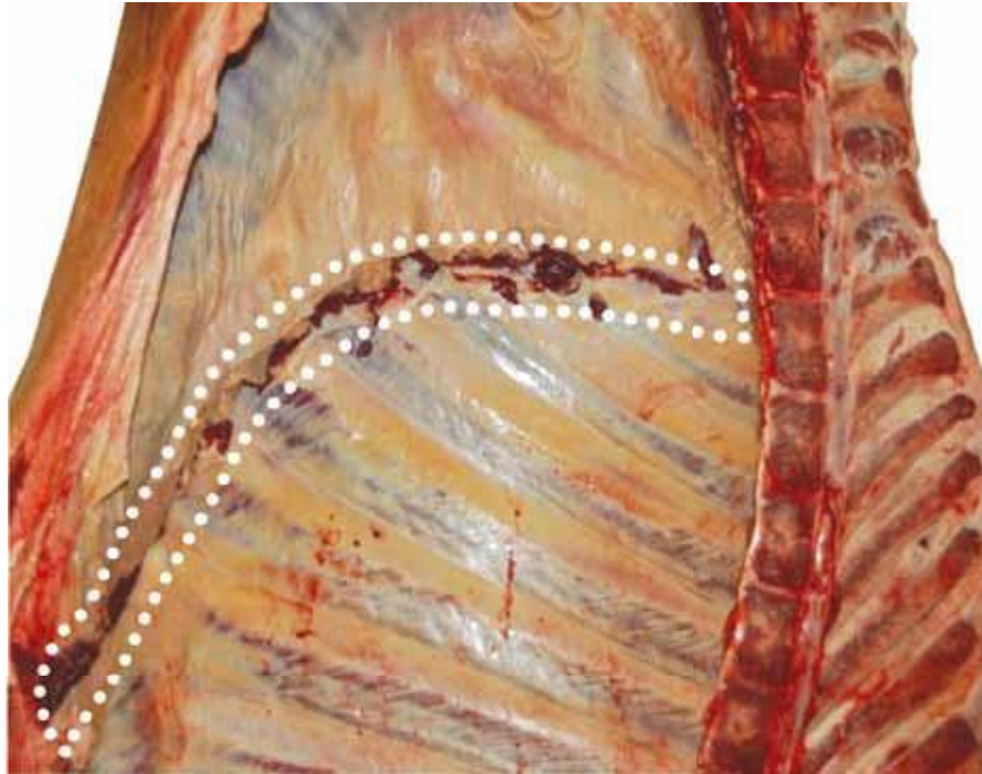
Figure 2 - Thin Skirt Removal