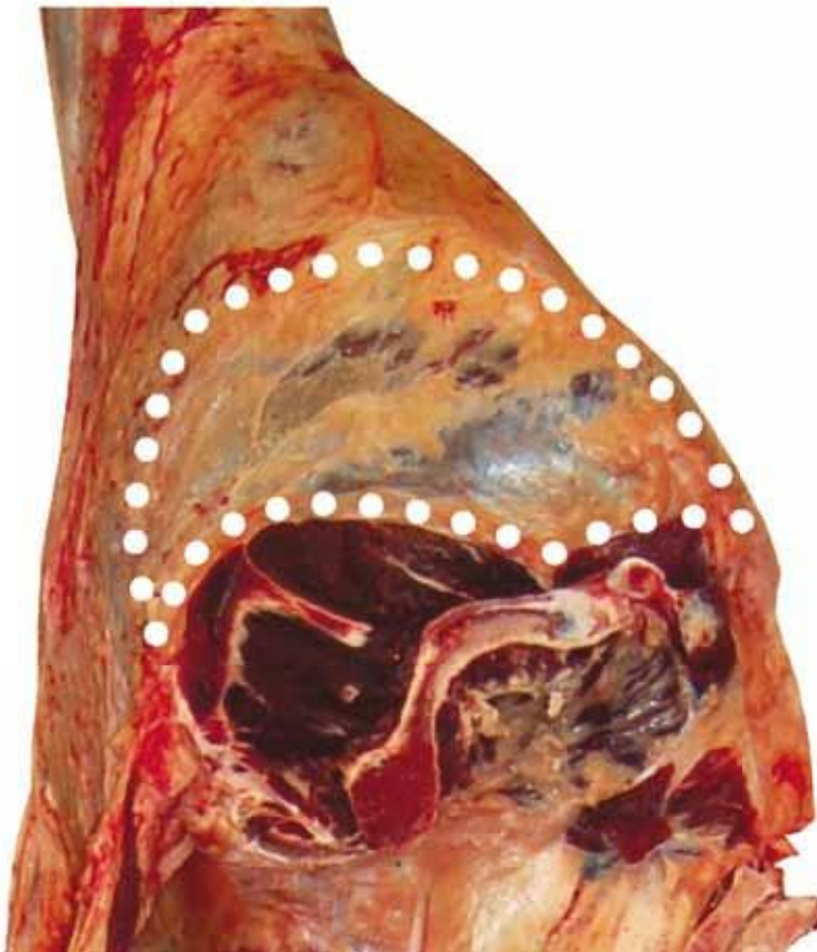
Figure 4 - Topside (Crown) Fat Trim

Photographs reproduced in agreement with RPA Inspectorate UK