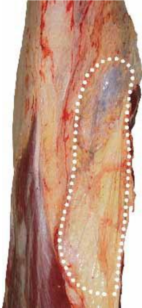
Figure 3 - Cod/Mammary (Udder) Fat Removal