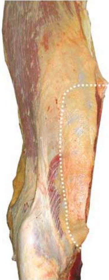
Figure 6 - Brisket Fat Trim