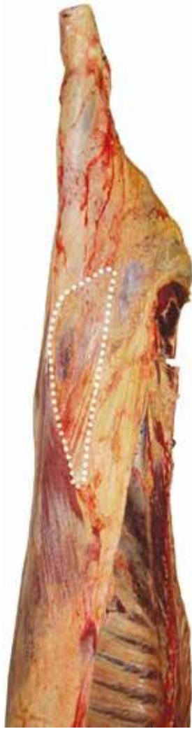
Figure 5 - Flank (Bed) Fat Trim