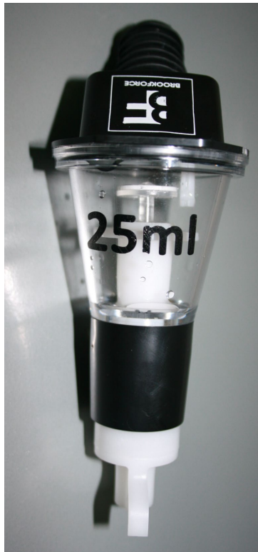
Figure 1 measure