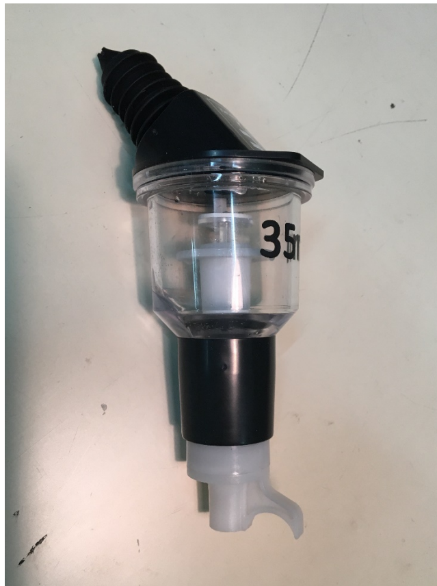
Figure 4 35 ml measure