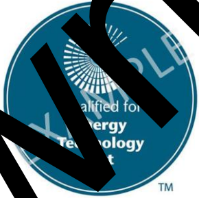
Figure 1 Figure 2

Below is some approved wording you can use on your social media updates on platforms such as LinkedIn and Twitter to promote your product listing on the Energy Technology List.