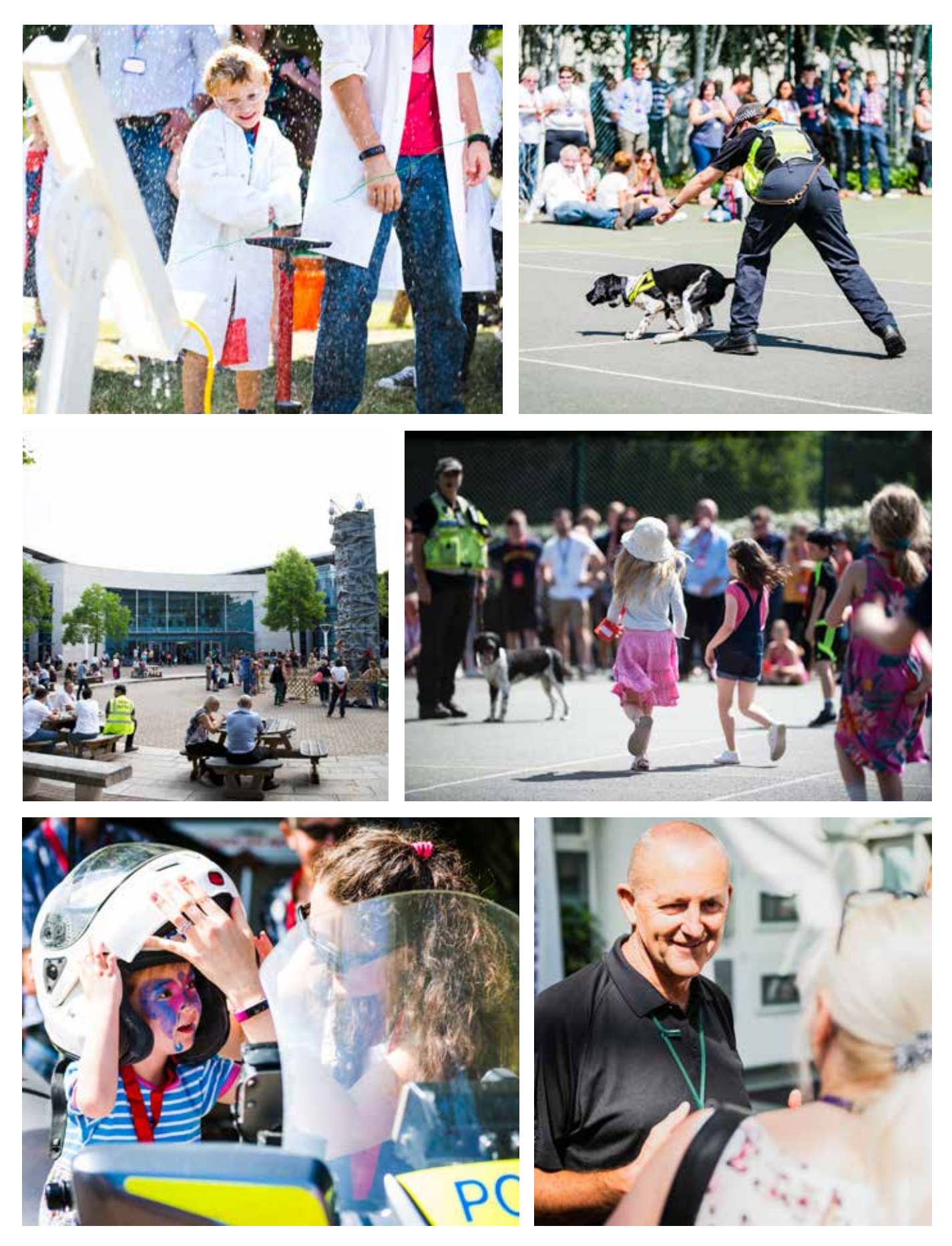
Pictured clockwise from top left: The bottle rocket stand proved a great draw, the ever popular MOD police dog demonstration, with the audience getting involved, DE&S staff involved in stalls across Abbey Wood, children got the opportunity to sit on a police bike, the climbing wall erected in the MOD Abbey Wood plaza