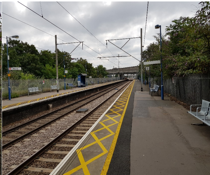
Angel Road station: basic facilities at existing station, looking towards North Circular Road