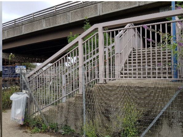
Angel Road station: staircase element linking Conduit Lane and footpath to platforms 130m south