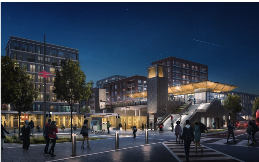
Artist's impression - night view of the new Meridian Water station from the south-east