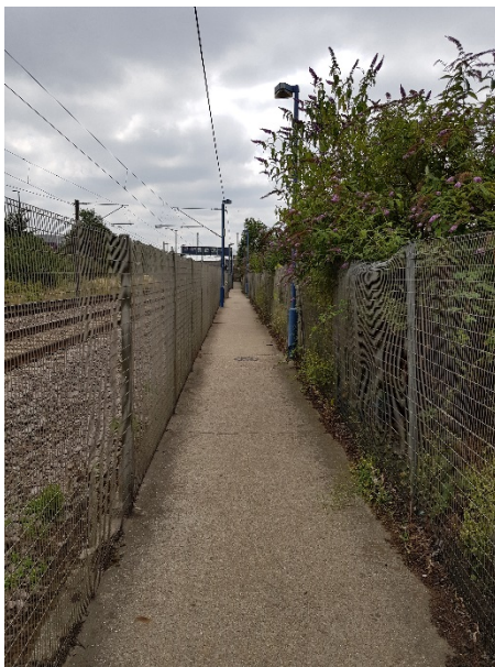
Angel Road station: footpath between Conduit Lane and platforms