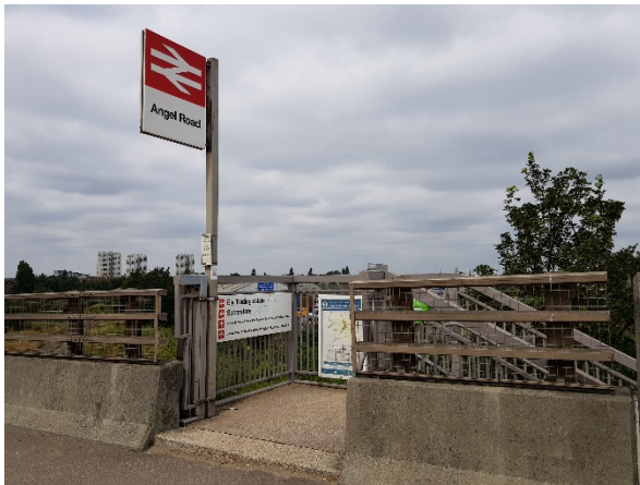
Angel Road station: entrance from Conduit Lane