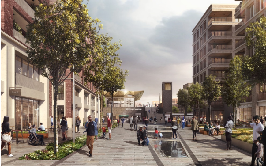
Artist's impression - day view of the new Meridian Water station from the west