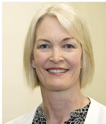
Oliver Dowden CBE MP

A blue ink signature of Margot James on a light-colored background.