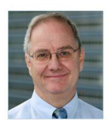
"It's fine designing an electronic system when you are sat behind a desk. My drivers work in the real world."