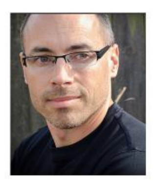
"I don't want to be mithered reading information or researching what is required"