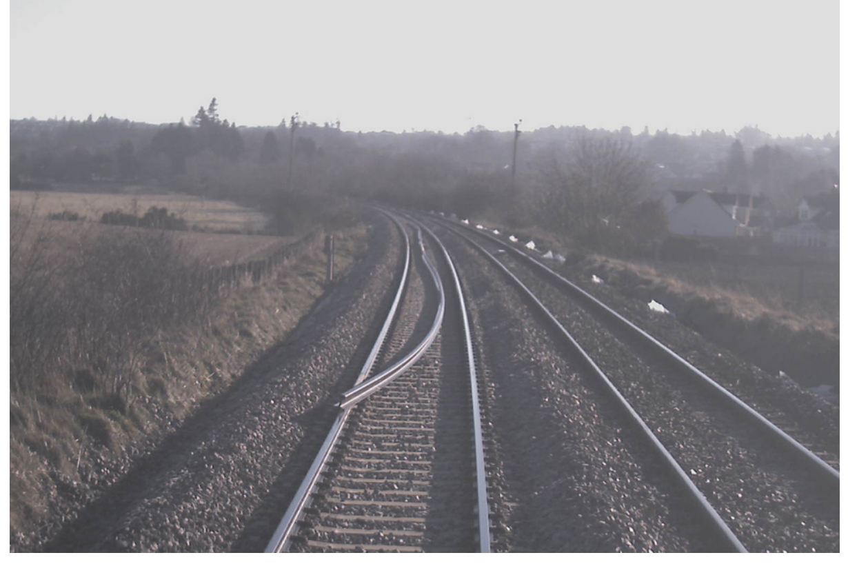
Image from Forward Facing CCTV of train 1E17 showing the rail just prior to impact